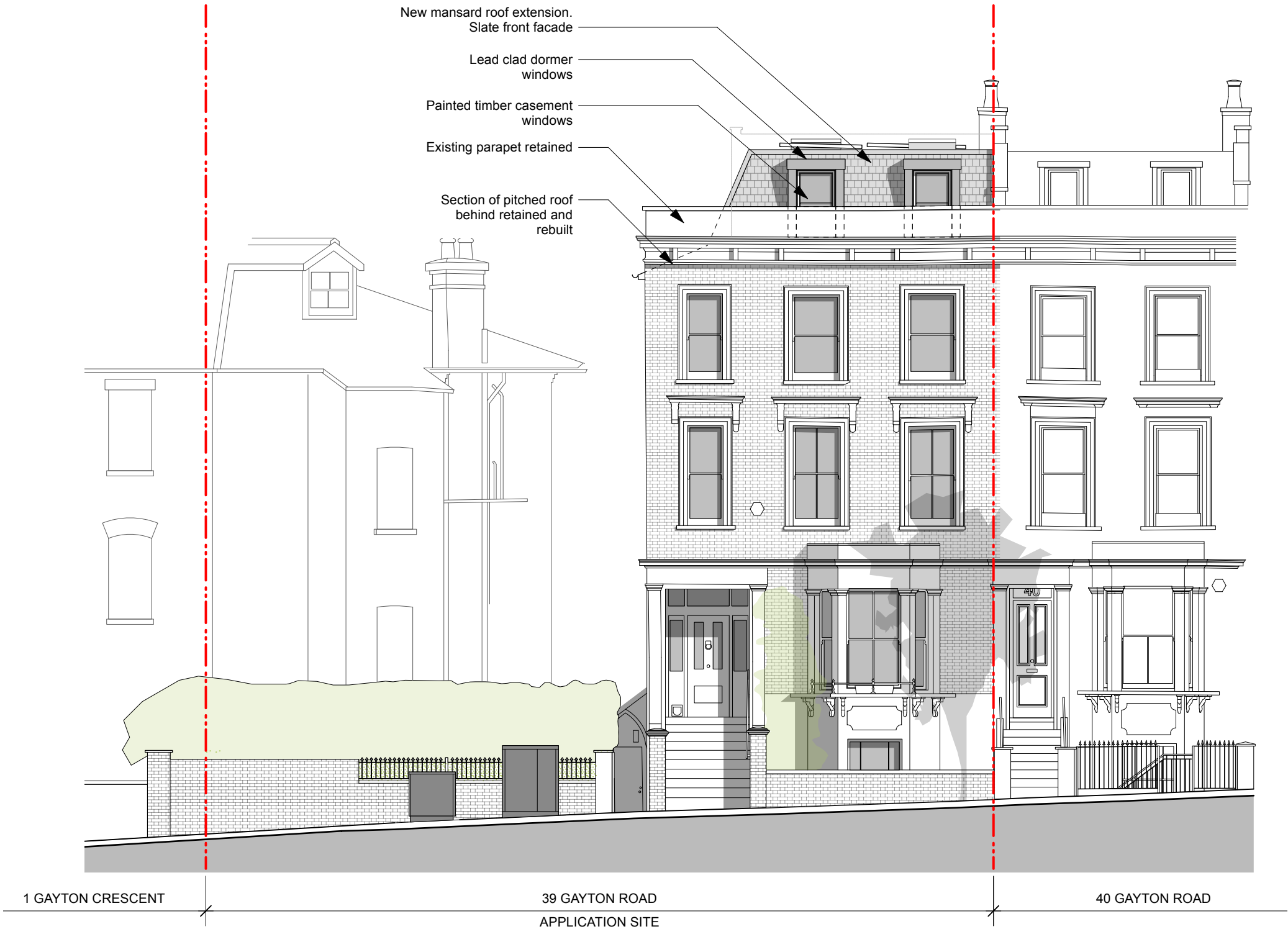
1 Proposed Front Elevation Scale: 1:100