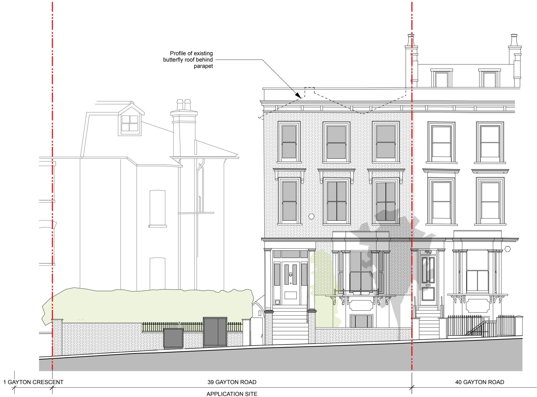
1 Existing Front Elevation Scale: 1:100