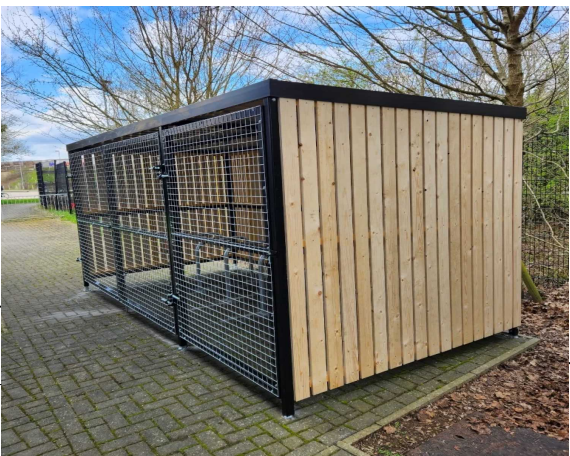
10 Space Amazon Eco Cycle Shelter by The Bike Storage Company 306 Harbour Yard, London, SW10 0XD