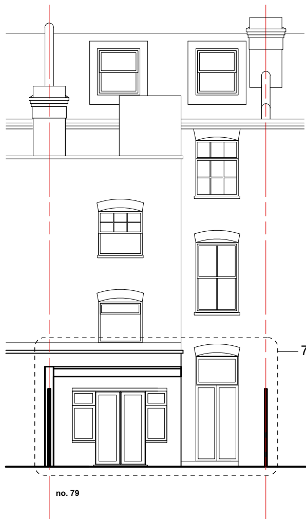
01 002 Rear Elevation, As Existing ELEVATION 1:100