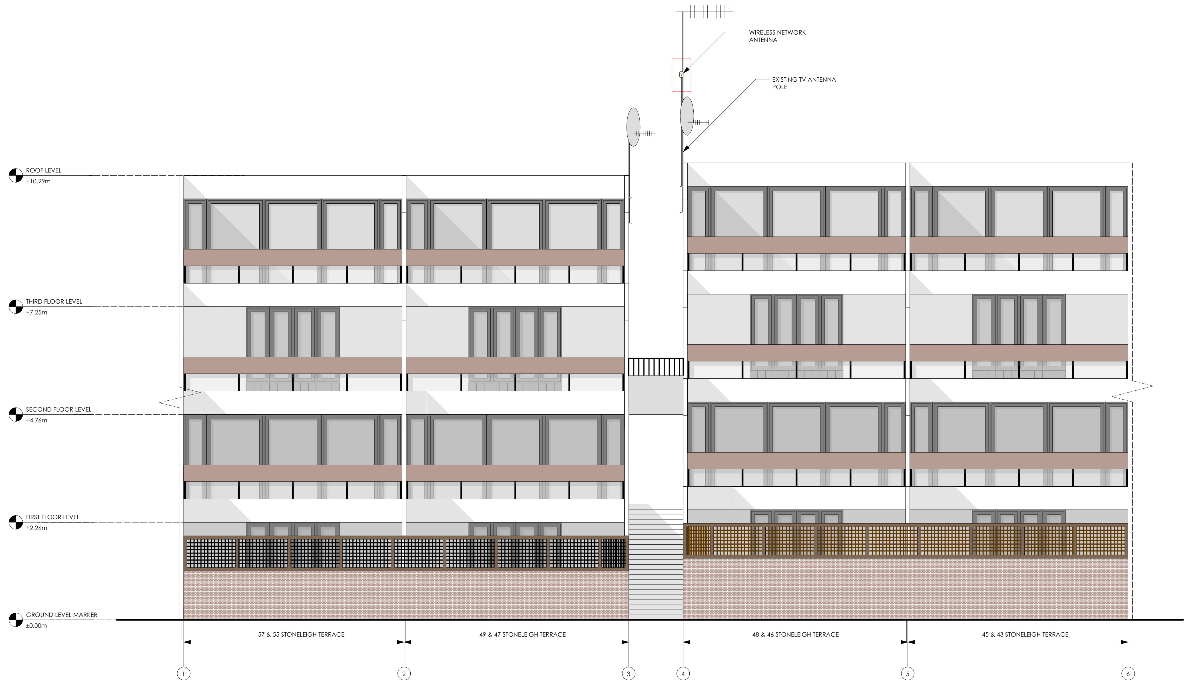
1 SOUTH EAST ELEVATION - RAYDON STREET 1:50