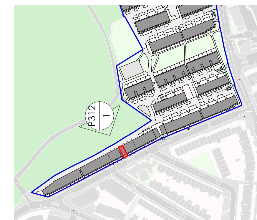
2 STONELEIGH TERRACE - KEY PLAN 1:2500