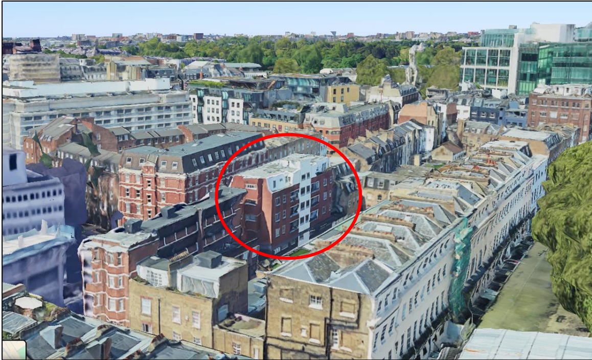
Figure 1: Google Satellite view (south of Glebe House looking north) showing Glebe House to be one of the largest buildings in the immediate vicinity.

A look on Google Satellite View (Figures 1 & 2) shows that there is a prevailing height datum at this location, and a prevailing roof line across the immediate surroundings and this can be seen to be the case for a considerable distance in all directions. Further, as it stands Glebe House is clearly one of the tallest buildings within the immediate area. Any new height above this prevailing roof line currently set by Glebe House, will stand out in a messy and incongruent manner.