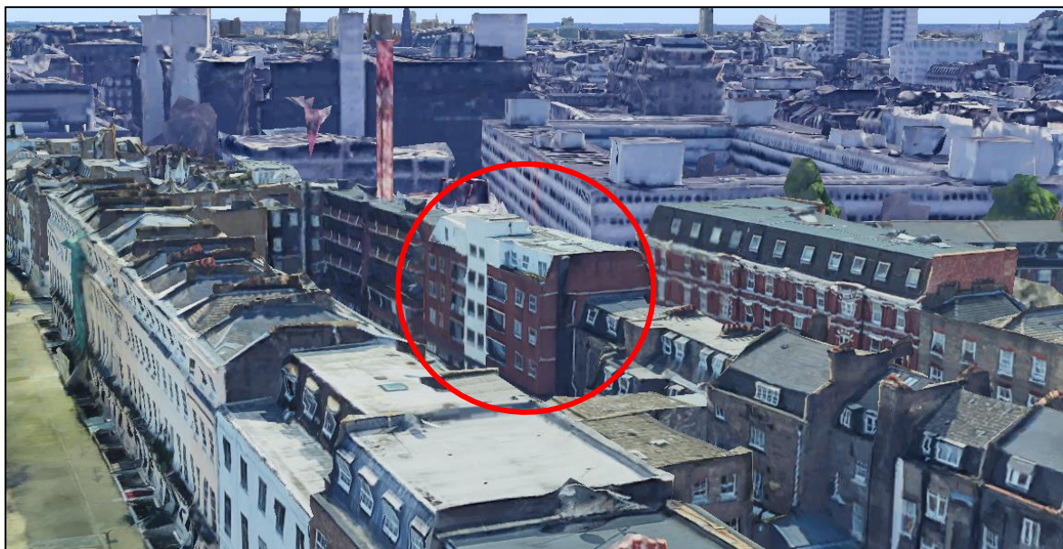
Figure 2: Google Satellite view (north of Glebe House looking south) showing Glebe House to be one of the largest buildings in the immediate vicinity.