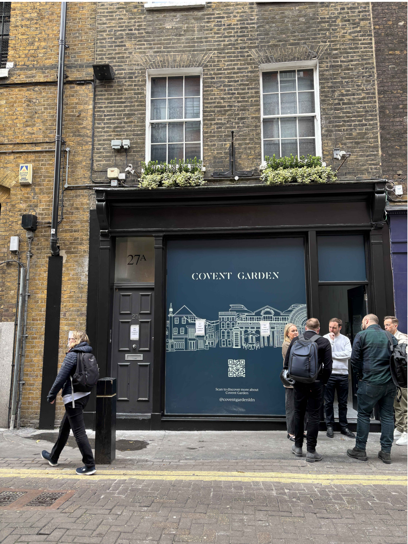
4 Existing Shop Front View NTS