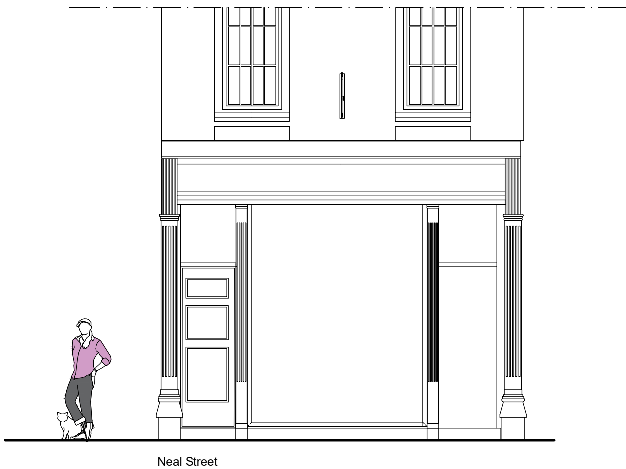
2 Existing Elevation 1:50 @ A1