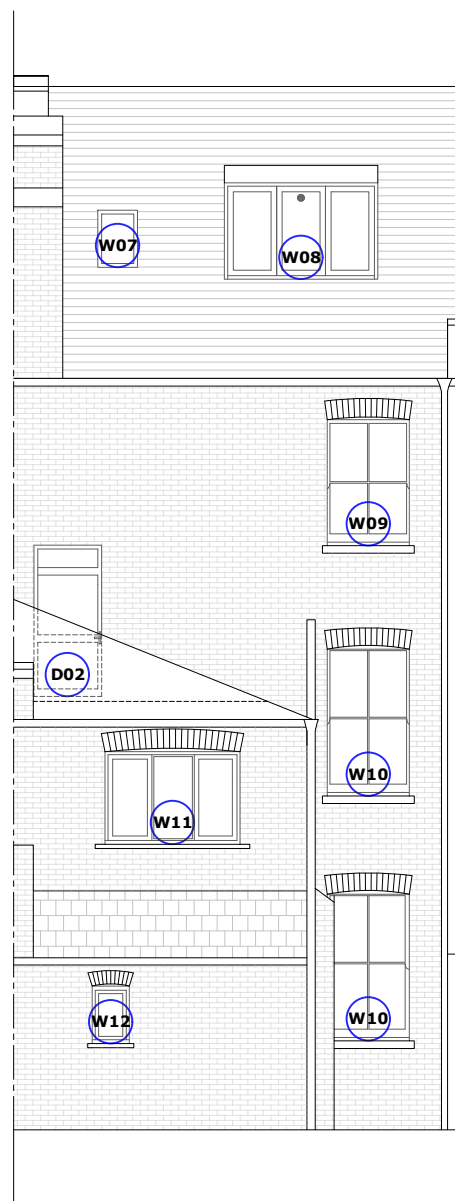
2 Existing West Elevation Scale: 1:100 @ A3