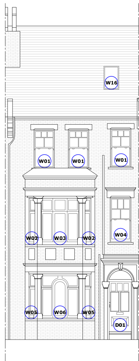
1 Existing East Elevation Scale: 1:100 @ A3