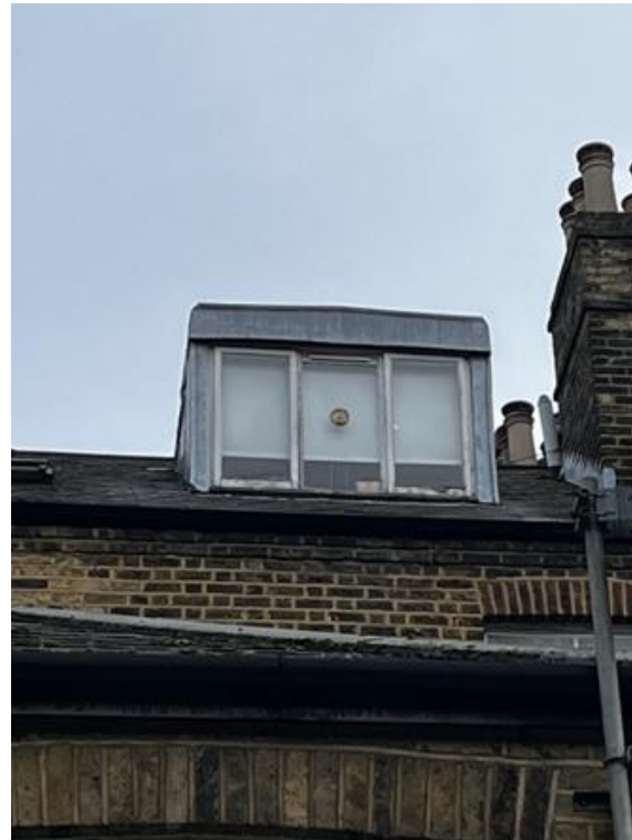
Second Floor Window (Rear)