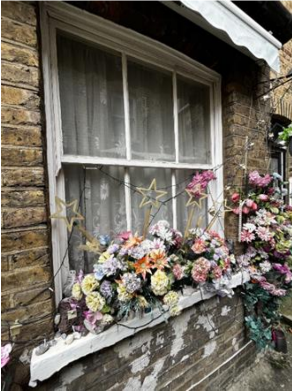
Ground Floor Window (Rear)