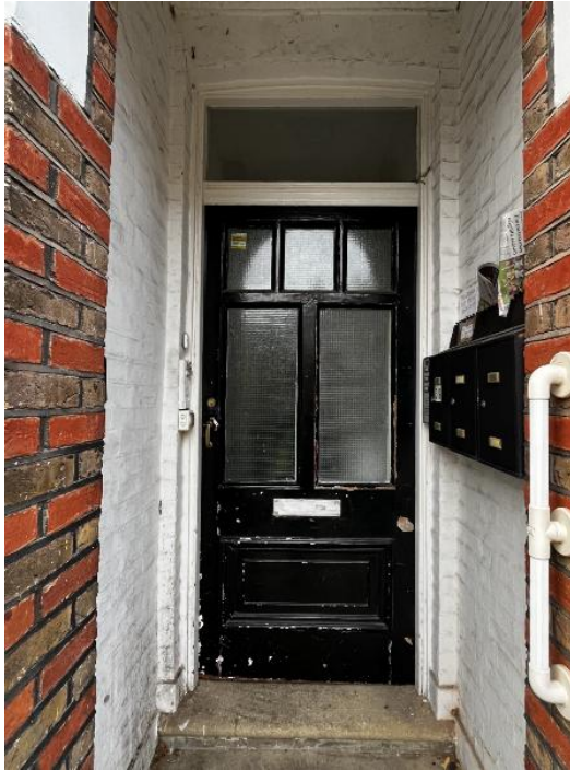
39 Estelle Road Main Door (Front)

The existing front communal entrance door is a black timber door, with 6 panels, 5 of which are glazed. The entrance also includes a rectangular fanlight above, with a letterbox and doorbell. There is also a black timber rear exit door with an upper glazed panel and fanlight above, both are shown in the pictures below.