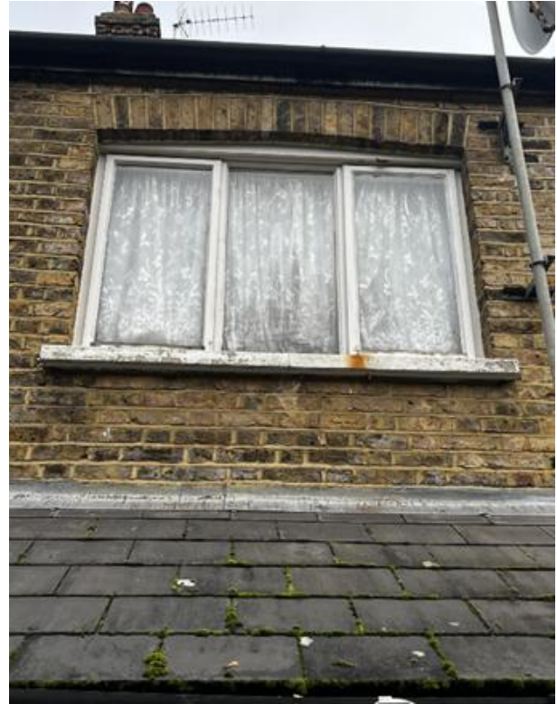
First Floor Window (Rear)