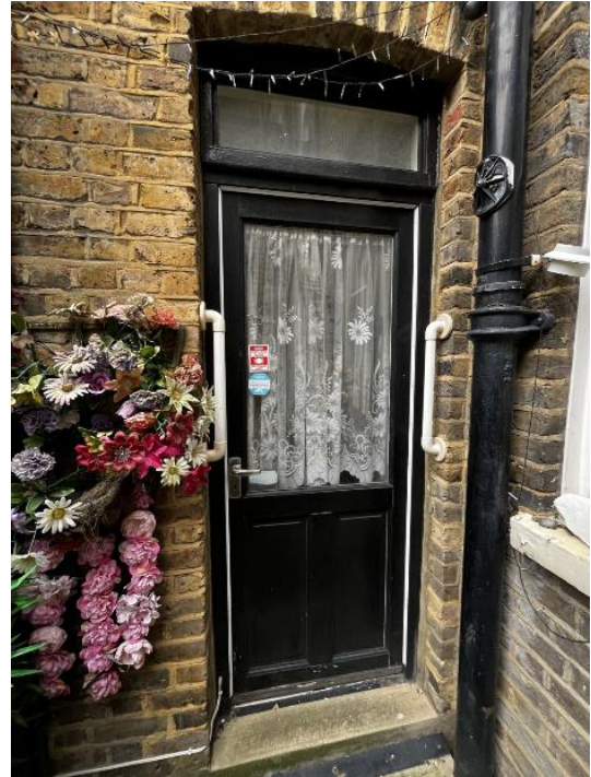
Rear Exit Door