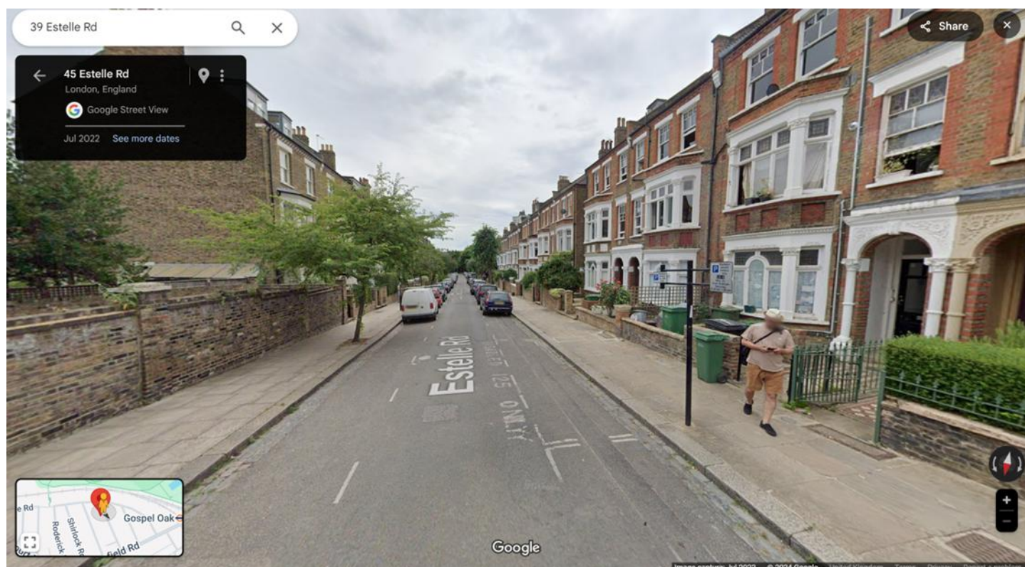
Car parking

39 Estelle Road does not have dedicated parking for residents. However, on-street parking is available in the vicinity, and residents can apply for parking permits from Camden Borough. Additionally, there may be restrictions on parking in certain areas, so checking local regulations is recommended.