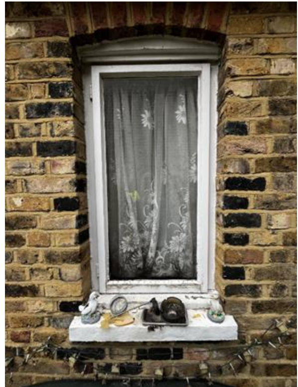
Ground Floor Window (Rear)