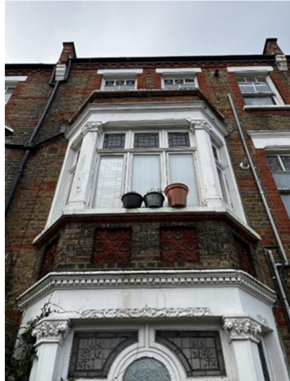
First Floor Window (Front) With Stained Glass