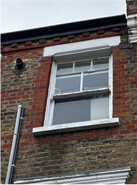
Second Floor Window (Front)