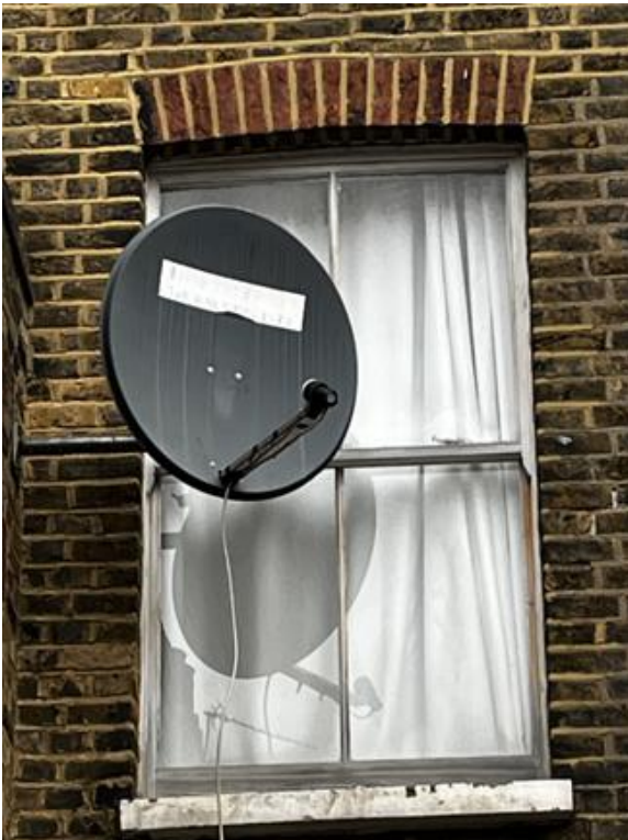
First Floor Window (Rear)