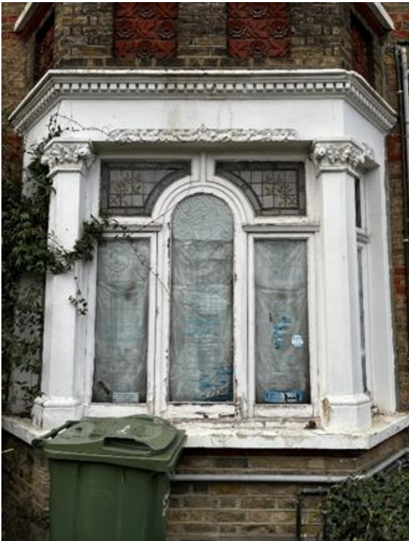
Ground Floor Window (Front) with stained glass