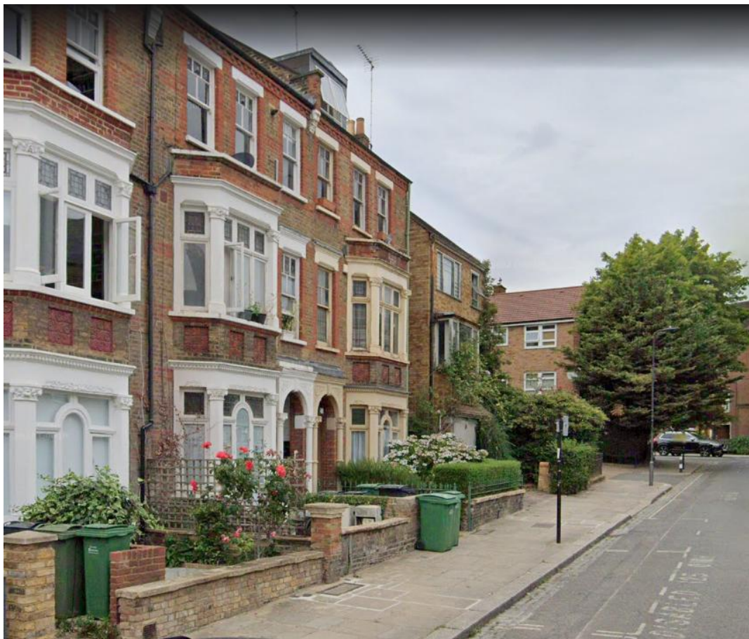
The Site viewed from Estelle Road.

The building consists of a terraced Victorian 3-storey house converted into 2 units. A large number of the properties on Roderick Road are of the same style and age.