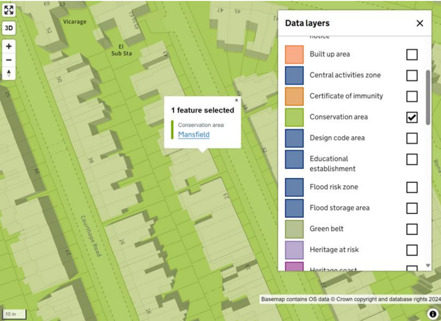
Conservation area boundary.

The building, hereafter referred to as the Site. The Site lies within the Mansfield Conservation Area (shown again below)