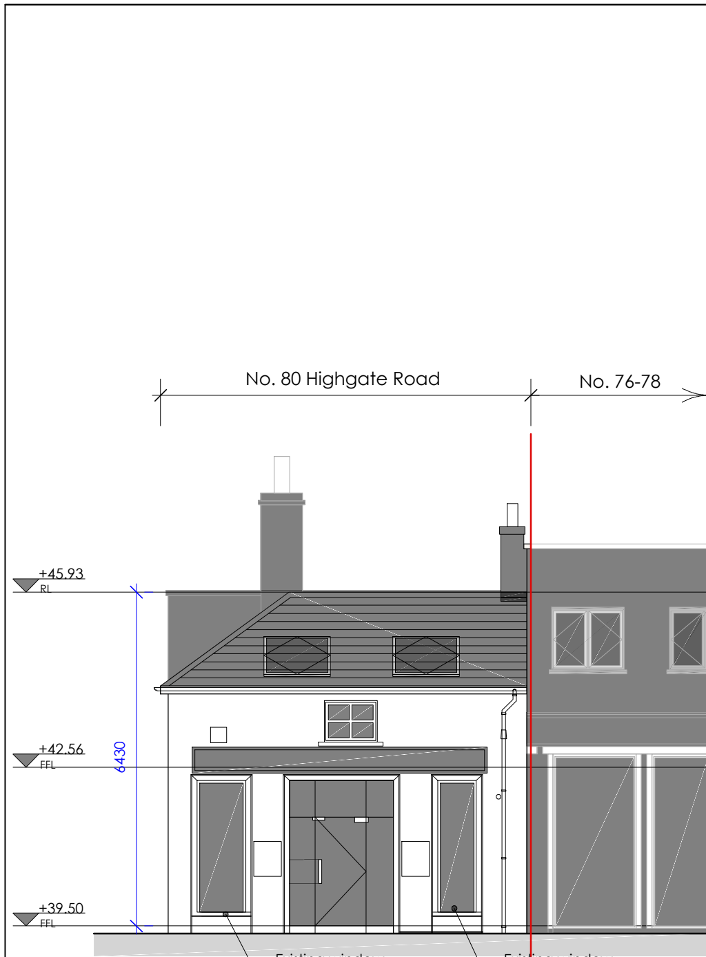
1 Proposed Front Elevation Scale: 1:100