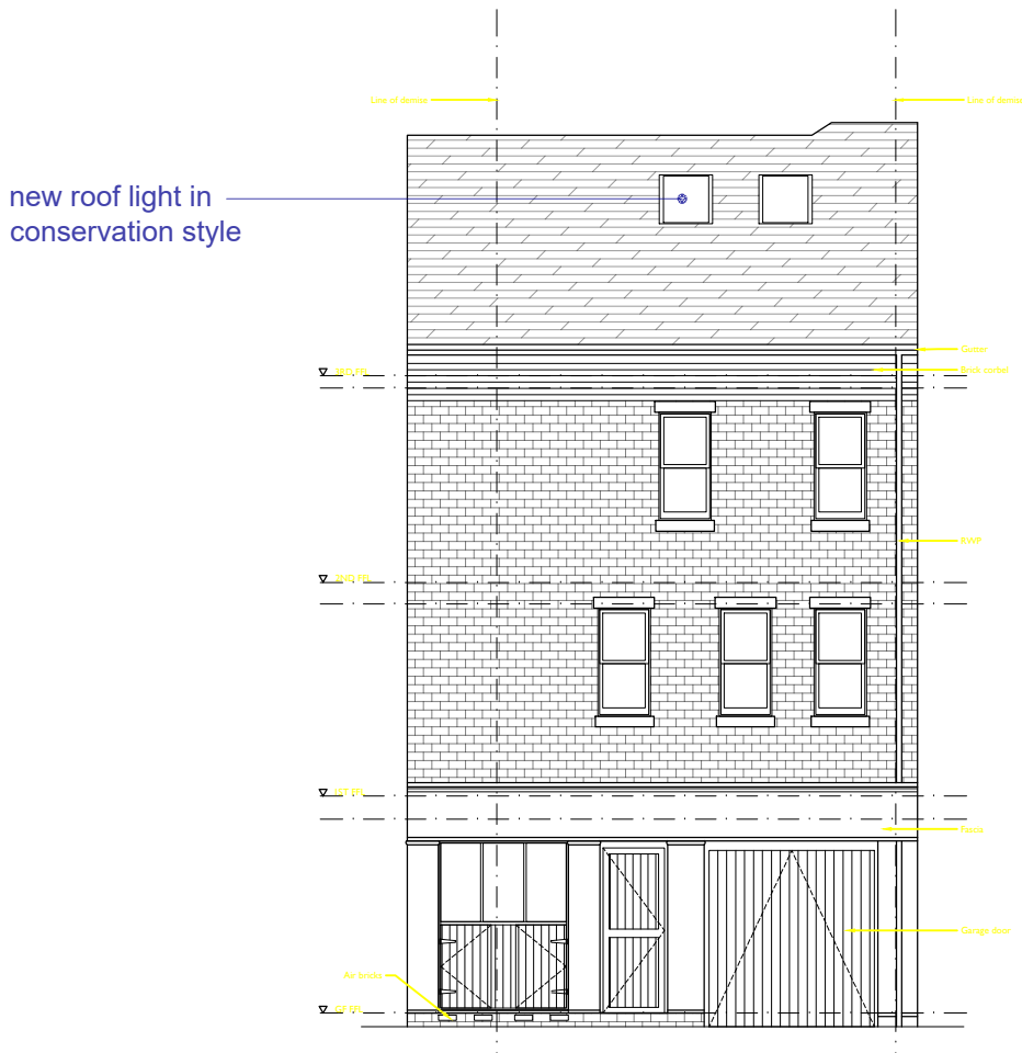
Front elevation as proposed 1:100 @A3

copyright rb.twelve ltd all rights reserved