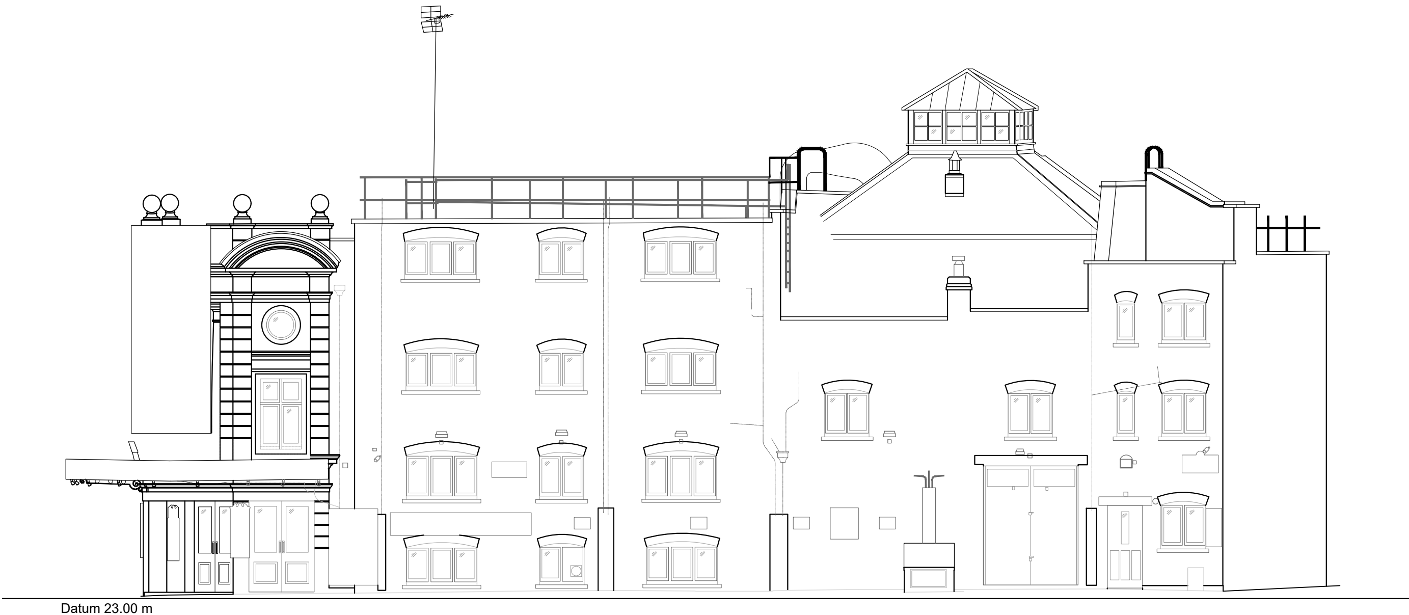
TOWER COURT ELEVATION 3