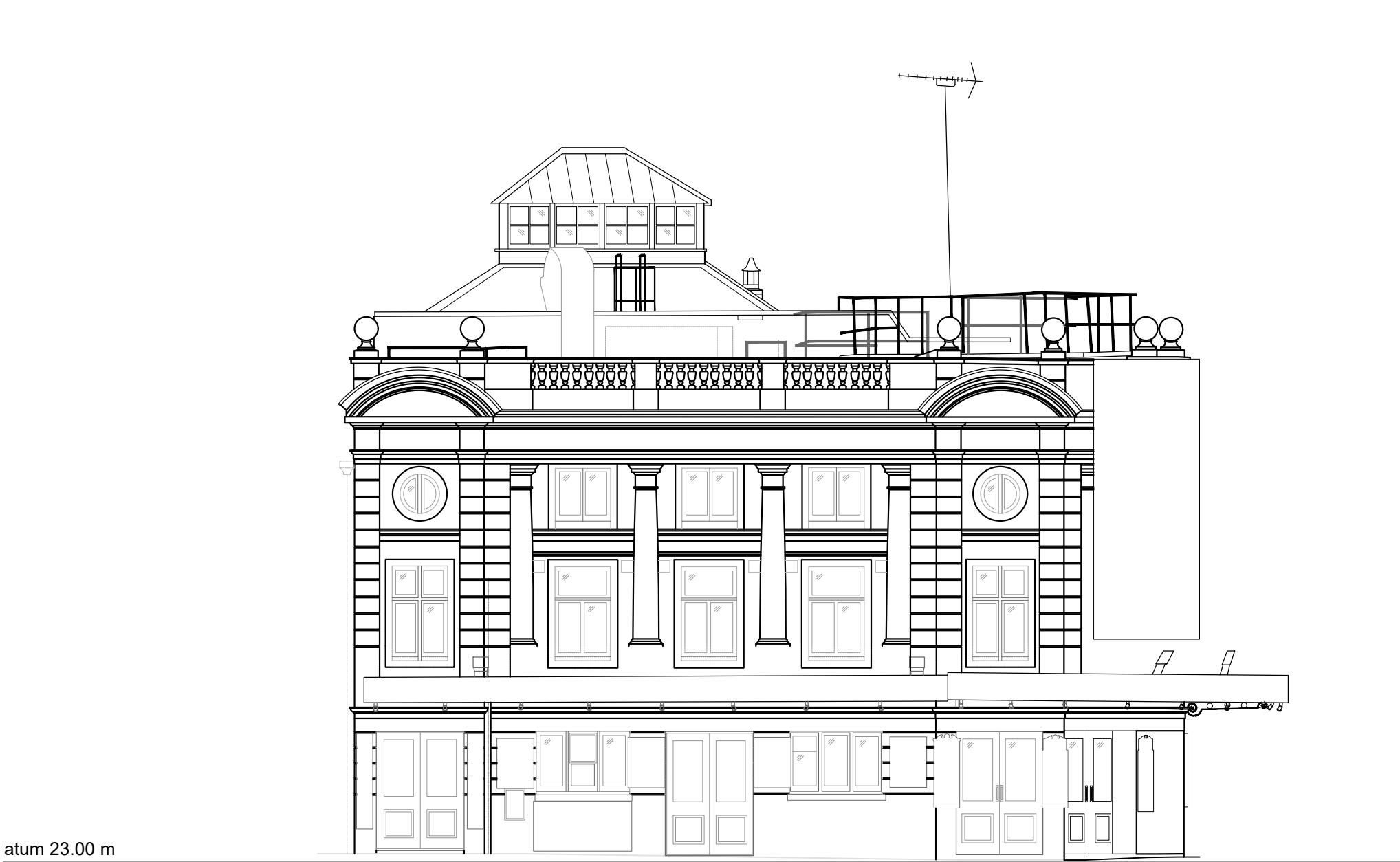
WEST STREET ELEVATION 1