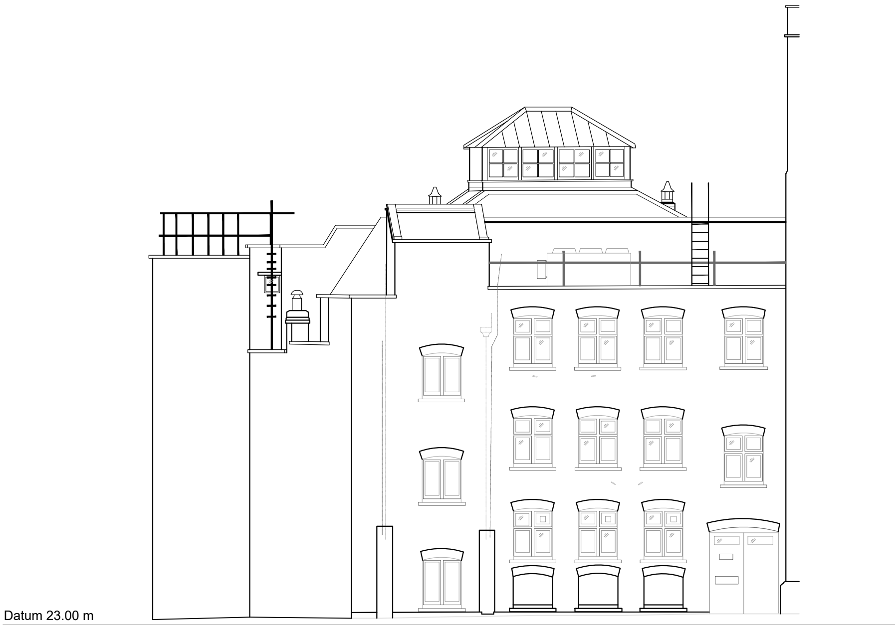
TOWER STREET ELEVATION 2