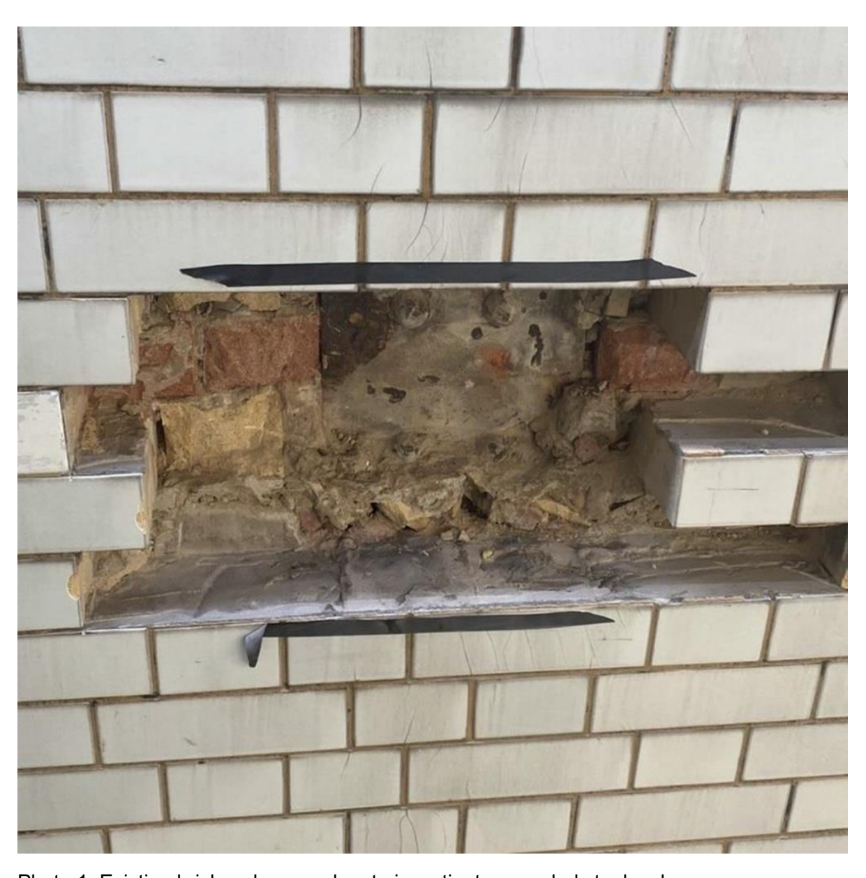
Photo 1. Existing brickwork opened up to investigate corroded steelwork.

The following is an example of brickwork replacement repair undertaken within the lightwell which is the benchmark for all repairs.