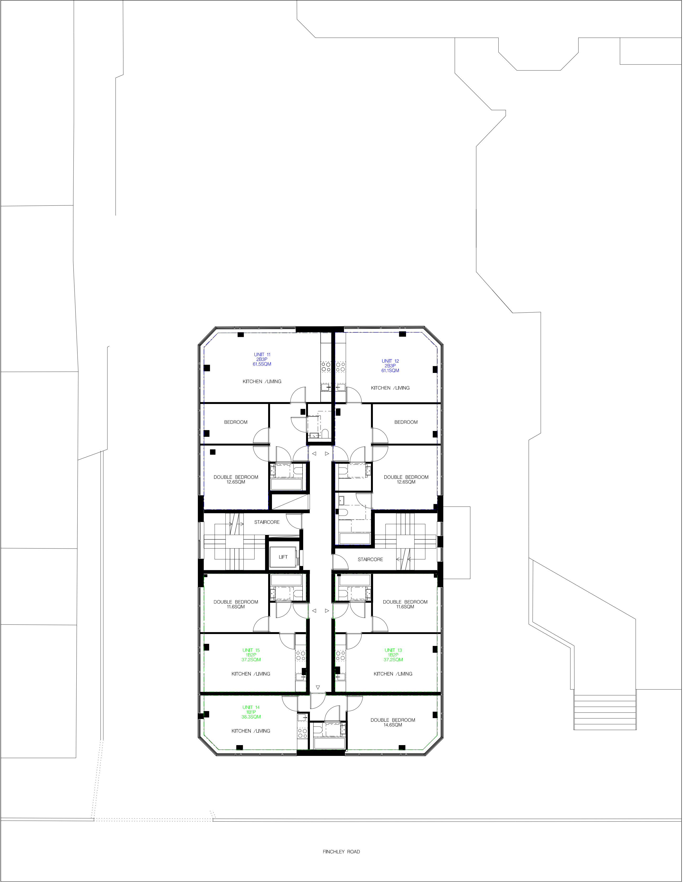
2 PROPOSED CLASS MA SECOND FLOOR PLAN