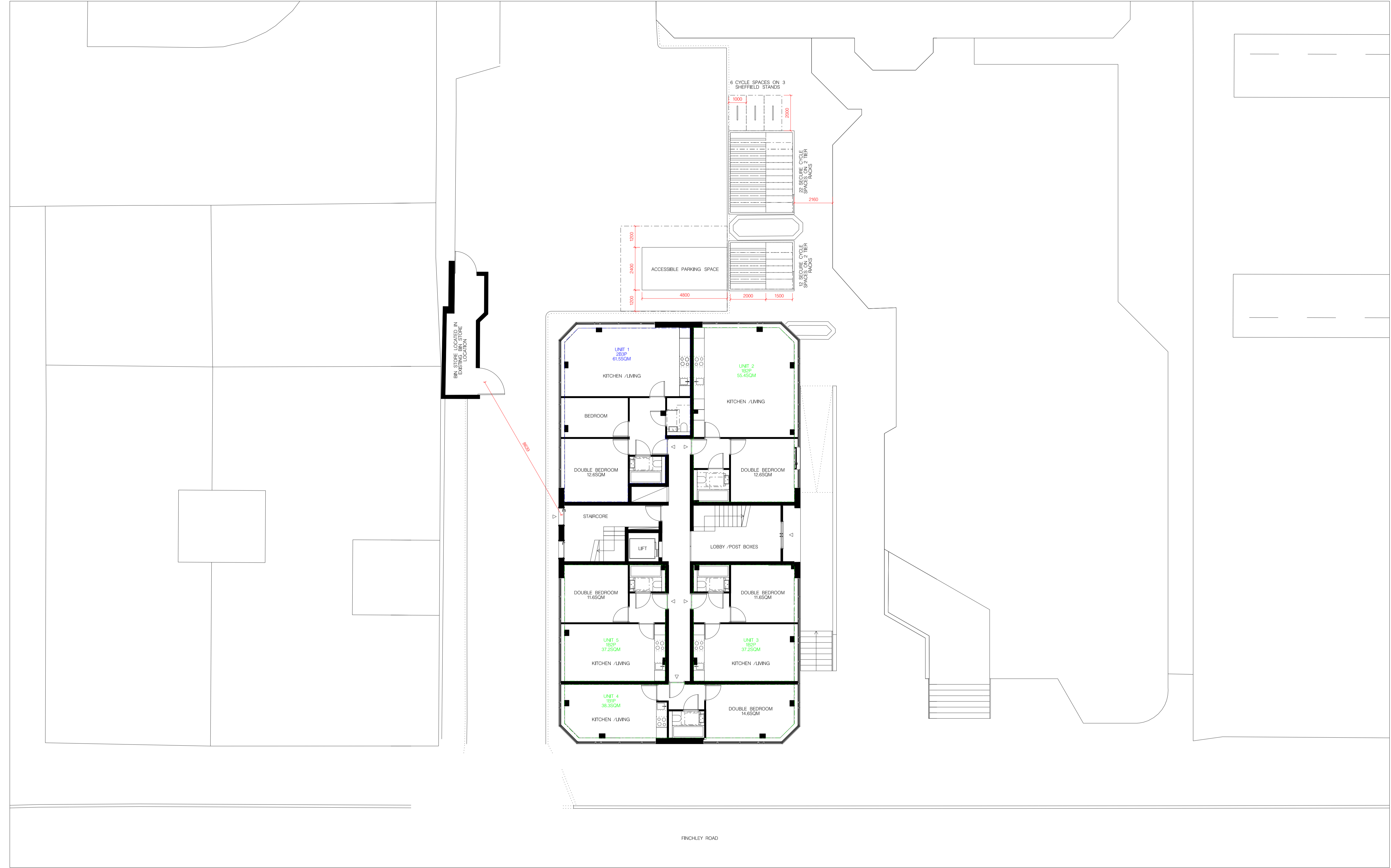
1 PROPOSED CLASS MA GROUND FLOOR PLAN