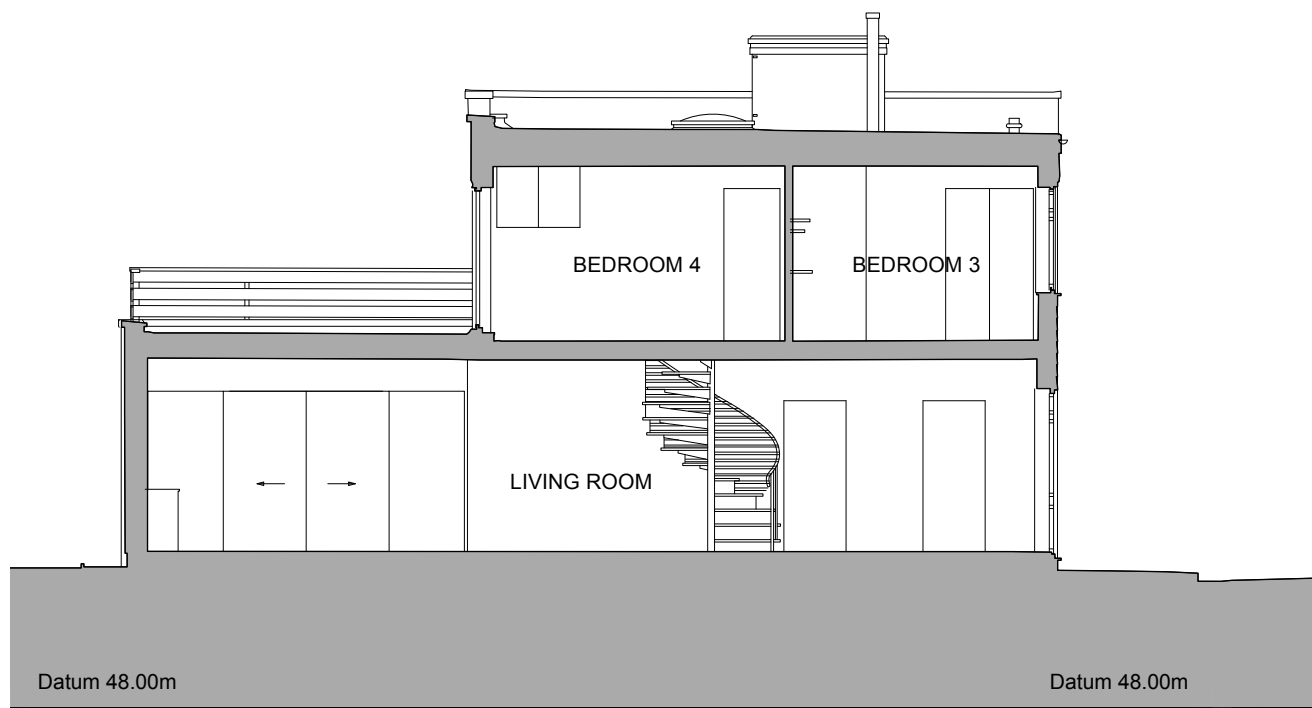
1 Existing Section AA Scale: 1:100