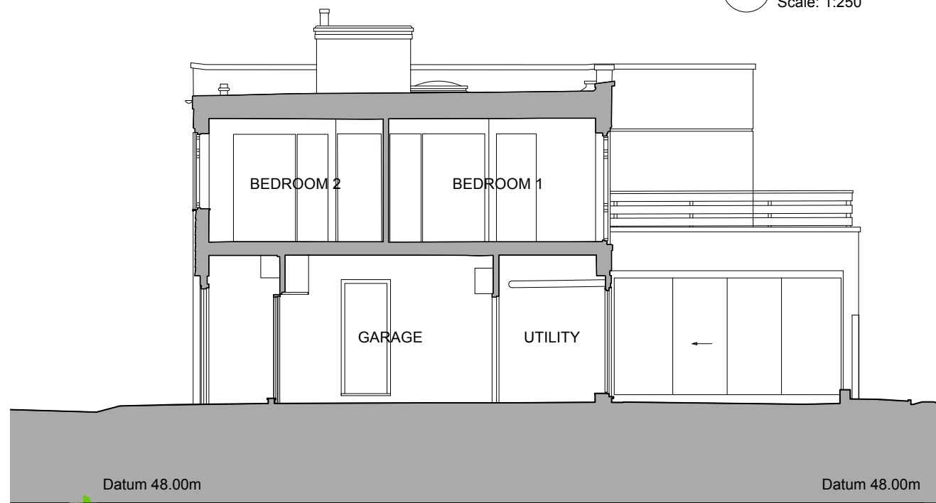
2 Existing Section BB Scale: 1:100