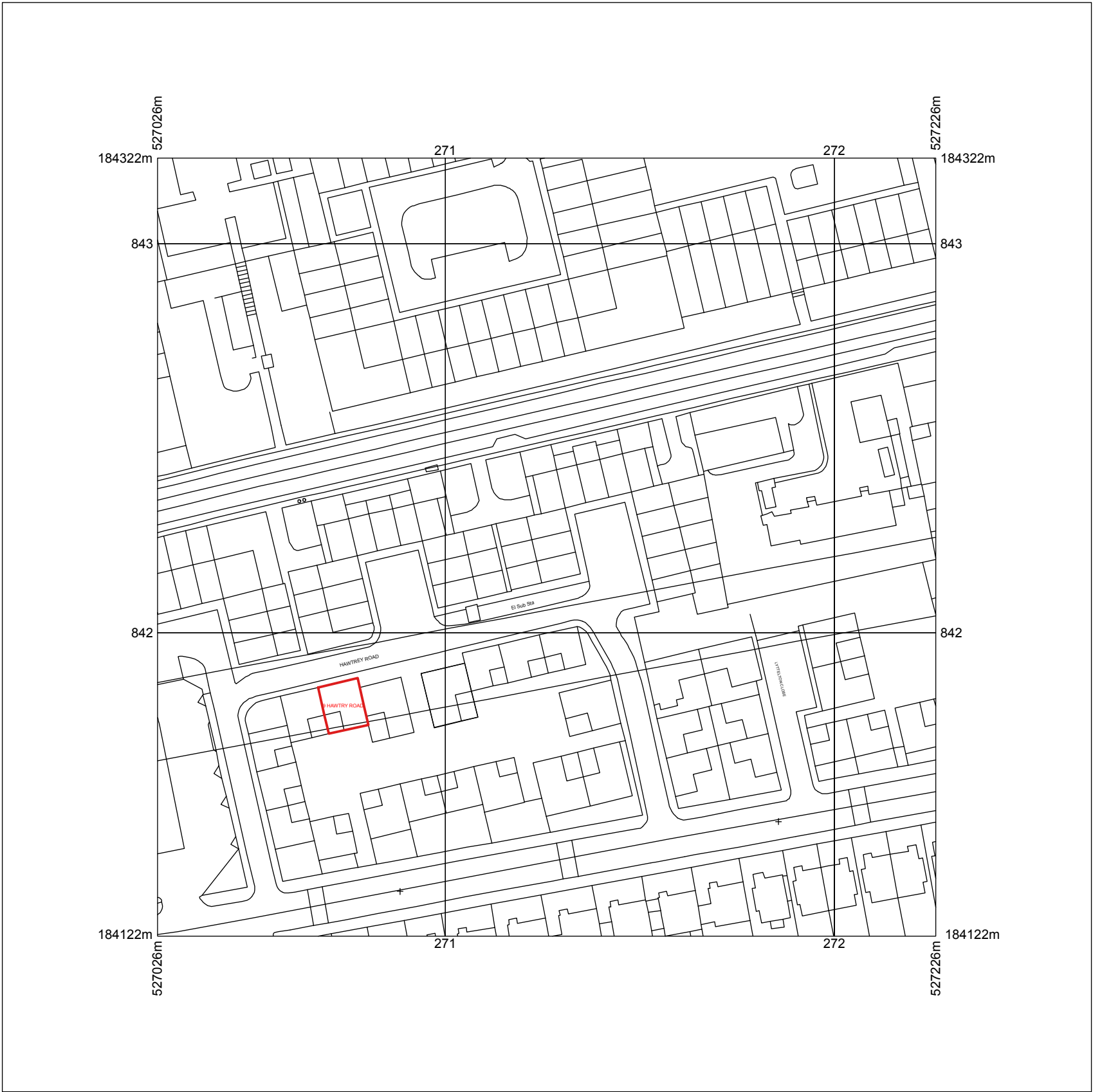
1 OS Plan Scale: 1:1250