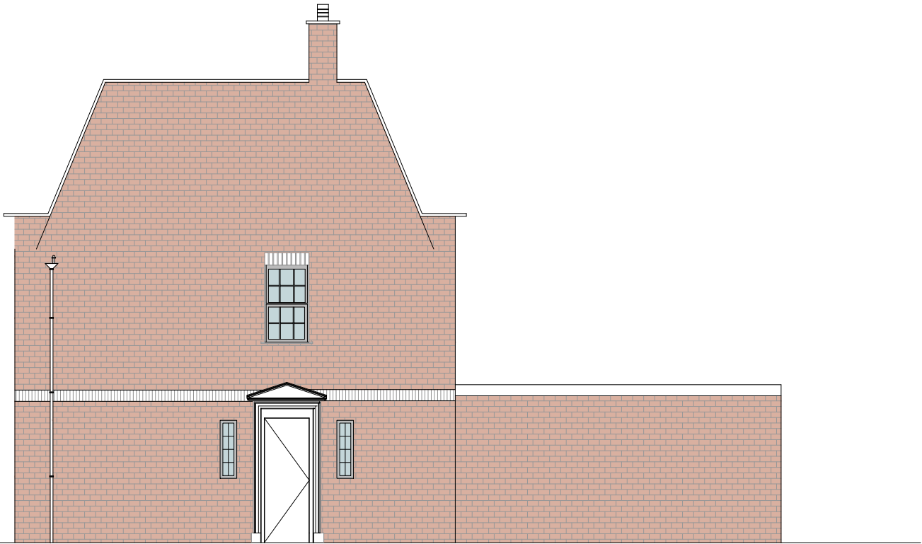
Exiting Side Elevation

NOTES: THE CONTRACTORS ARE TO CHECK ALL DIMENSIONS, DRAIN RUNS AND GENERAL CONDITIONS ON SITE BEFORE WORKS COMMENCE, AND INFORM STUDIO 47 ARCHITECTS IMMEDIATELY UPON DISCOVERY OF ANY ERRORS, OMISSIONS OR DISCREPANCIES ALL WORKS ARE TO BE CARRIED OUT IN ACCORDANCE WITH CURRENT BUILDING REGULATIONS, BRITISH STANDARDS, CODE OF PRACTICE AND LOCAL AUTHORITY REQUIREMENTS. DO NOT SCALE FROM THIS DRAWING WITHOUT FIRST OBTAINING WRITTEN AUTHORIZATION FROM STUDIO 47 ARCHITECTS. THE CONTENTS OF THIS PLAN INCLUDING THE PRINTED NOTES ARE COPYRIGHT AND REPRODUCTION IN WHOLE OR PART IS NOT PERMITTED WITHOUT PRIOR CONSENT OF STUDIO 47 ARCHITECTS IN WRITING.