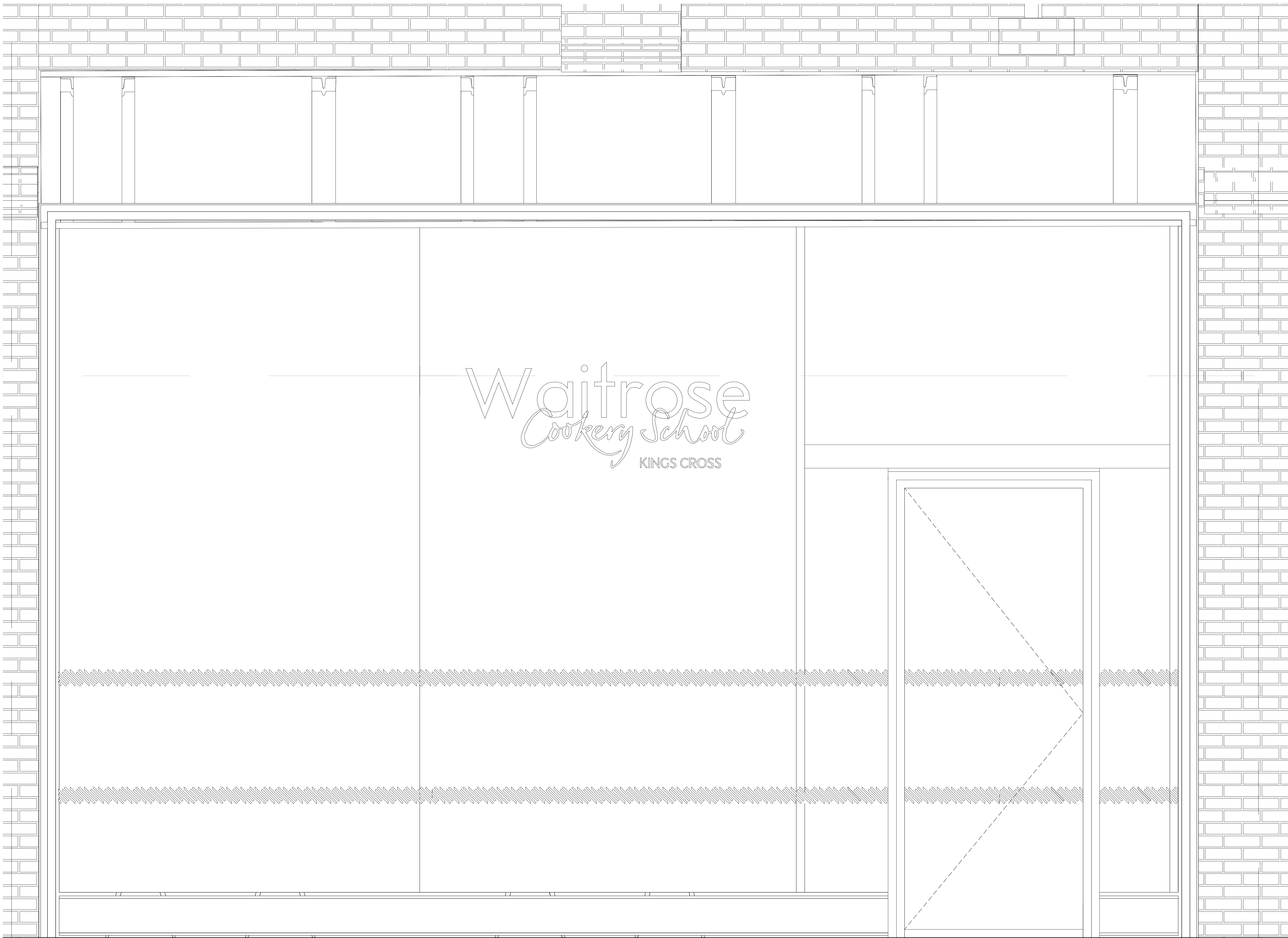
1 DETAILED ELEVATION OF PROPOSED DOOR 1 : 10