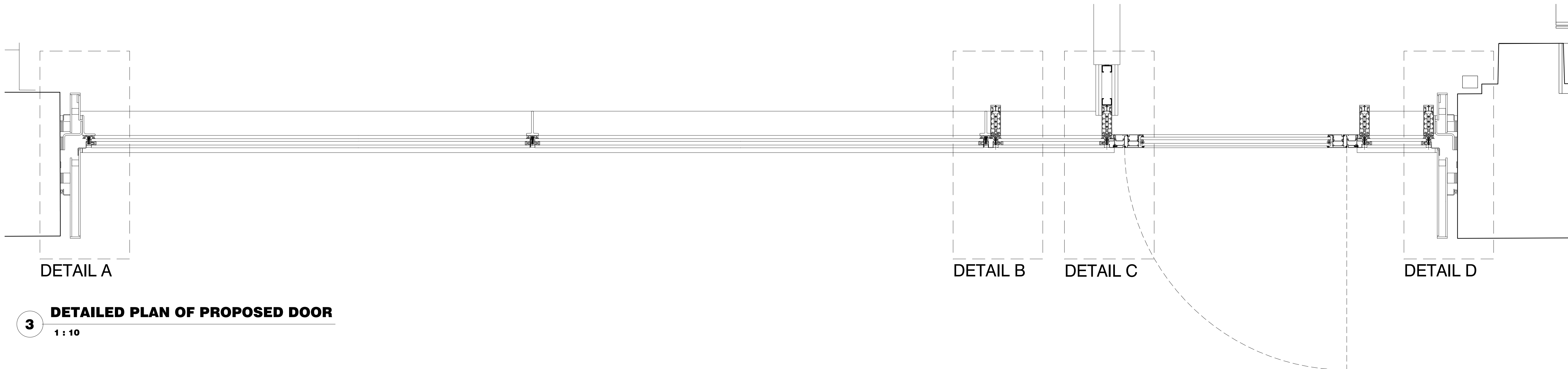
3 DETAILED PLAN OF PROPOSED DOOR 1 : 10