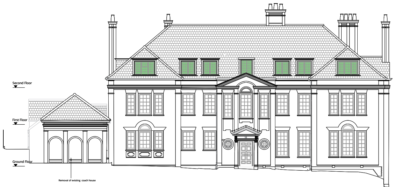
Proposed front Elevation Roof finishes - Scale 1:100