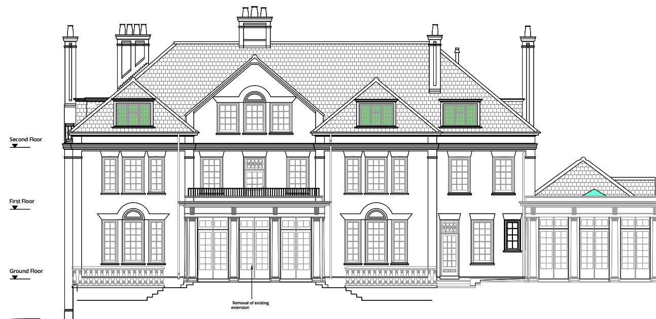
Proposed front Elevation Roof finishes - Scale 1:100