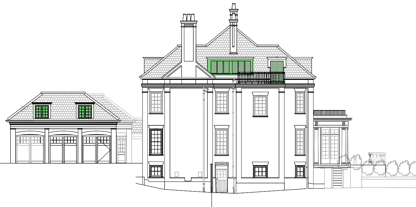
Proposed Side Elevation (North facing) Roof finishes - Scale 1:100