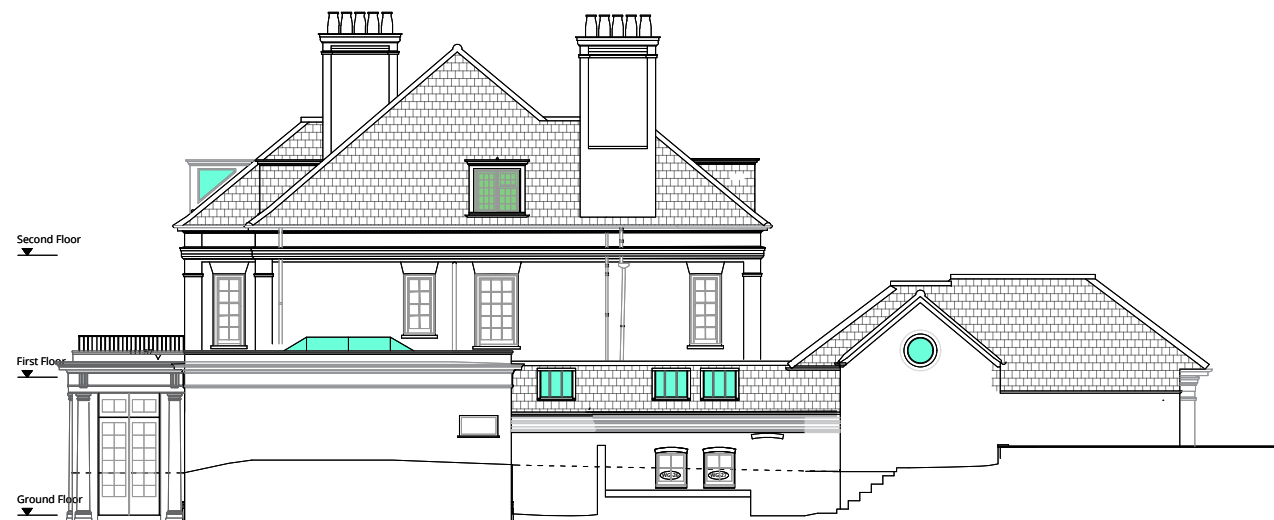
Proposed Side Elevation ( South facing ) Roof finishes - Scale 1:100