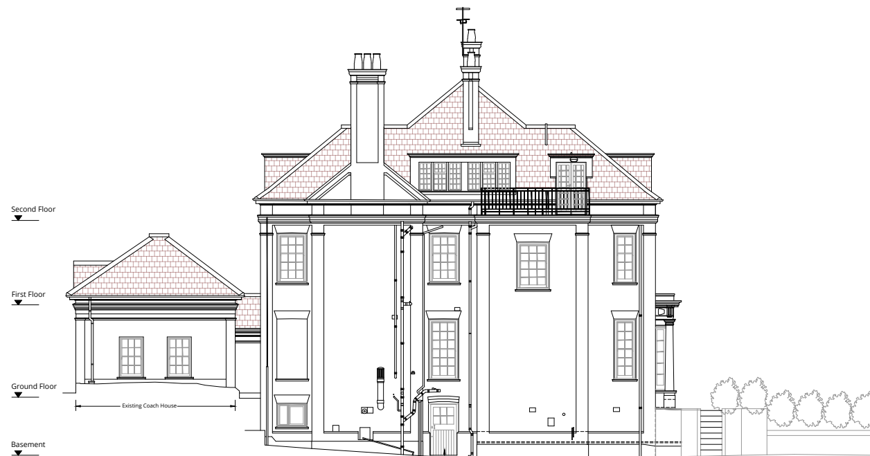
Existing Side Elevation (North facing) - Scale 1:100