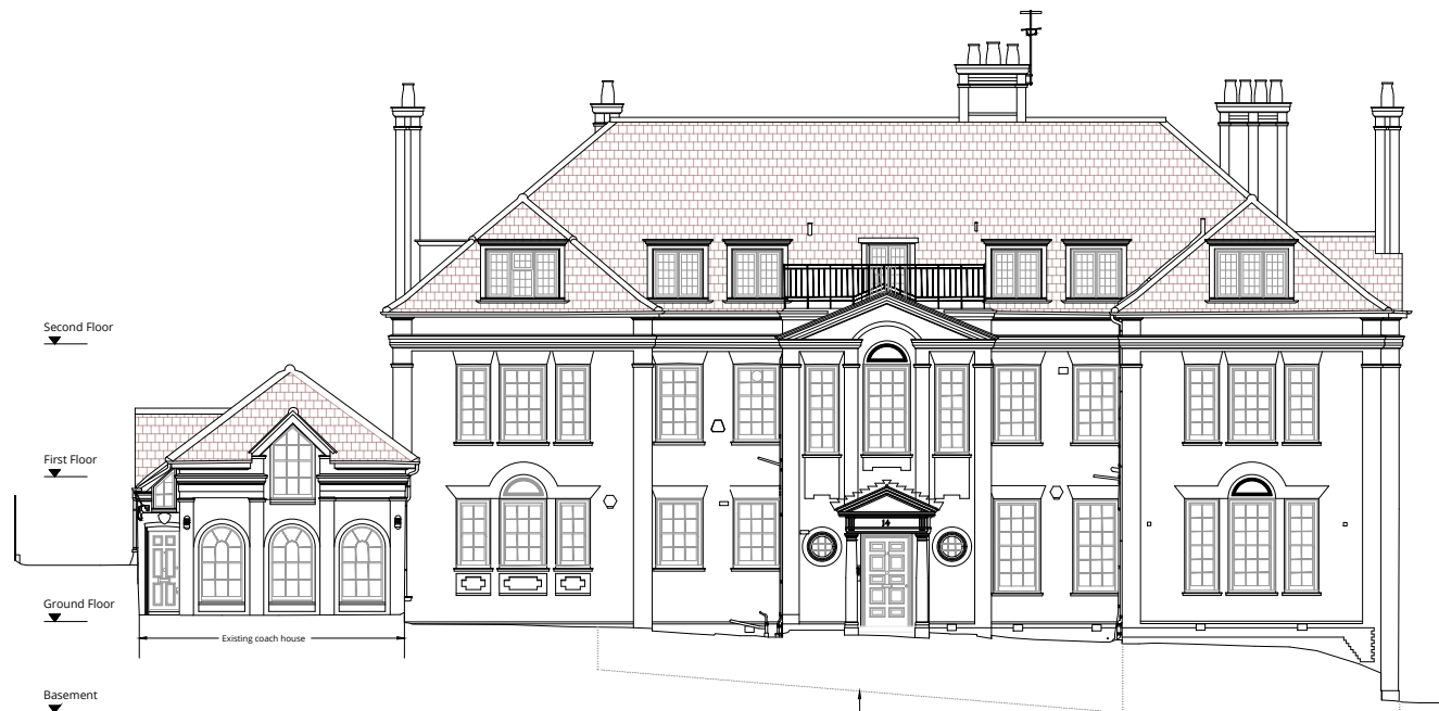
Existing front Elevation - Scale 1:100