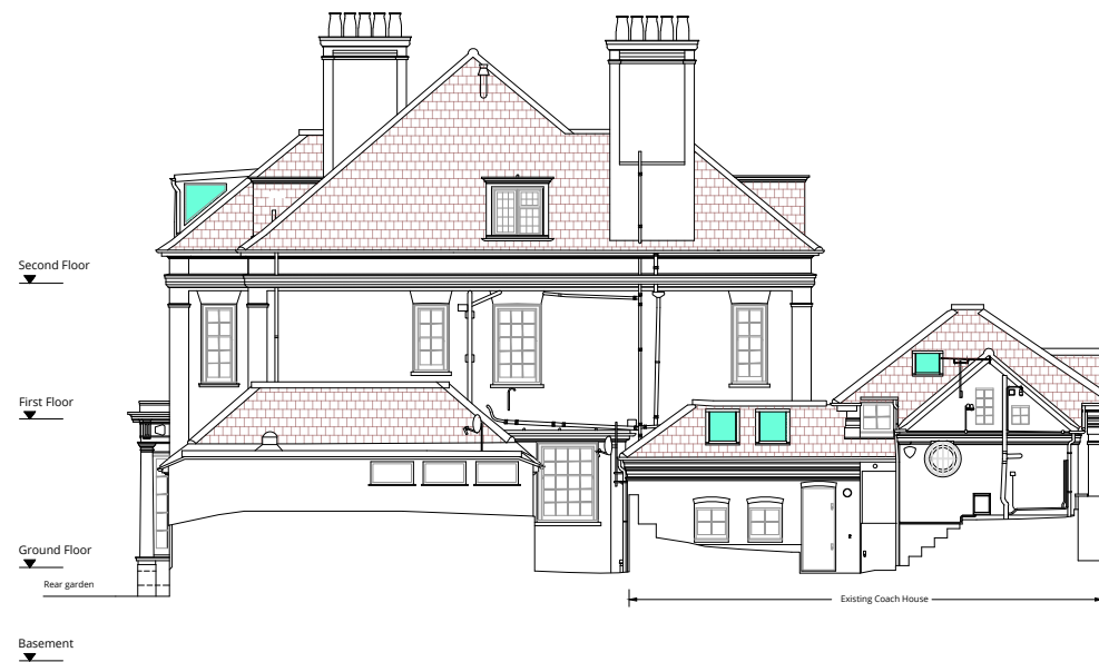
Existing Side Elevation ( South facing ) - Scale 1:100