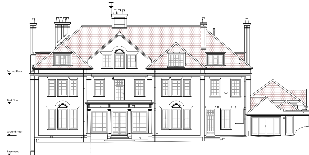
Existing front Elevation - Scale 1:100