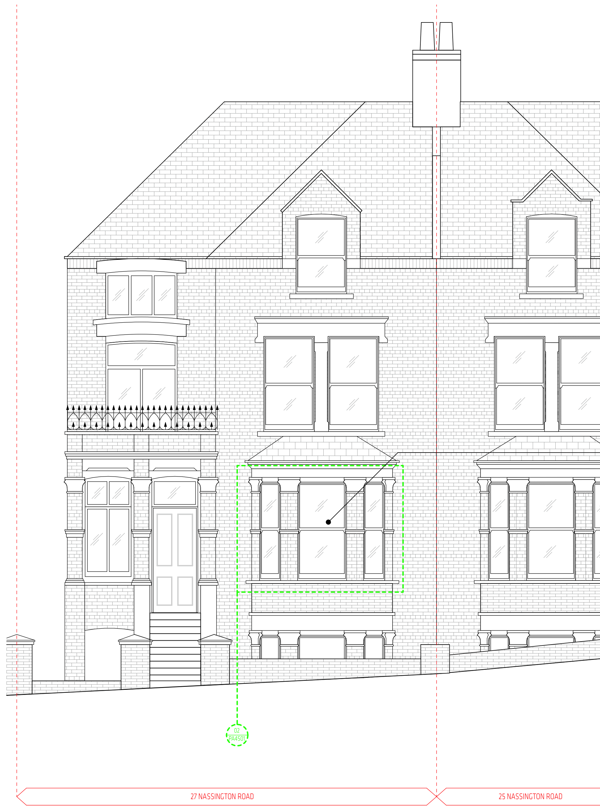
01 — Proposed Front Elevation 1:50