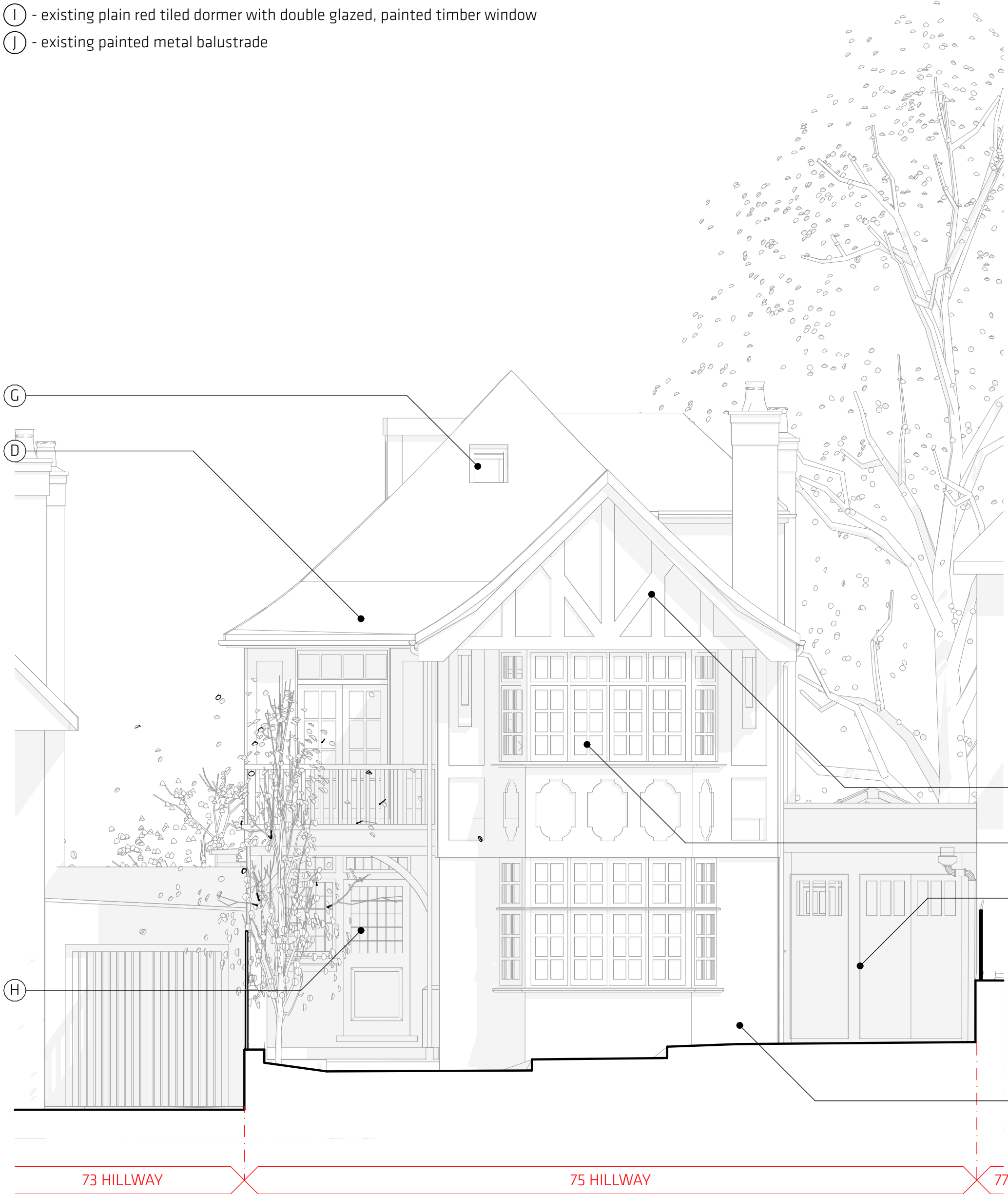
01 Existing Elevation Front [NE] Scale @ A1: 1:50