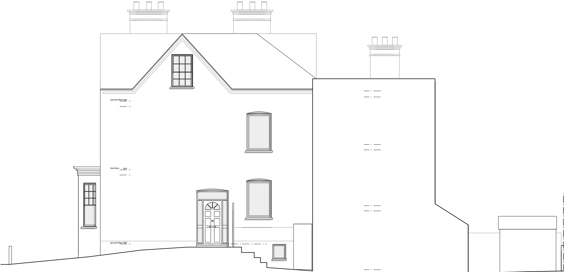
EAST SIDE ELEVATION