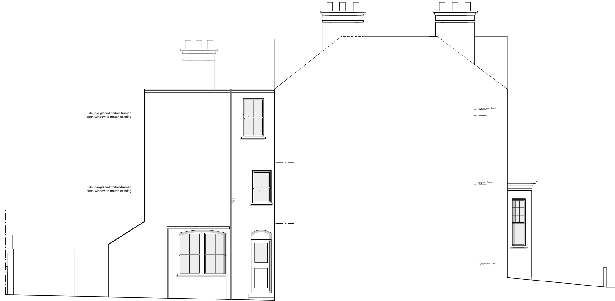
WEST SIDE ELEVATION