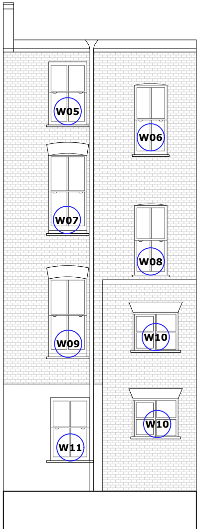
2 Proposed South Elevation Scale: 1:100 @ A3