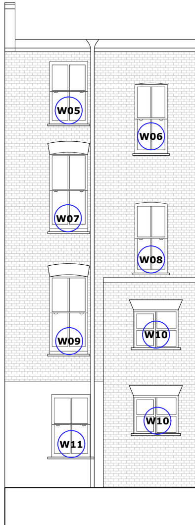
2 Existing South Elevation Scale: 1:100 @ A3