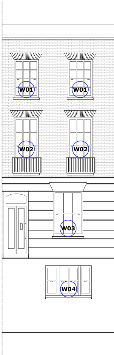
1 Existing North Elevation Scale: 1:100 @ A3