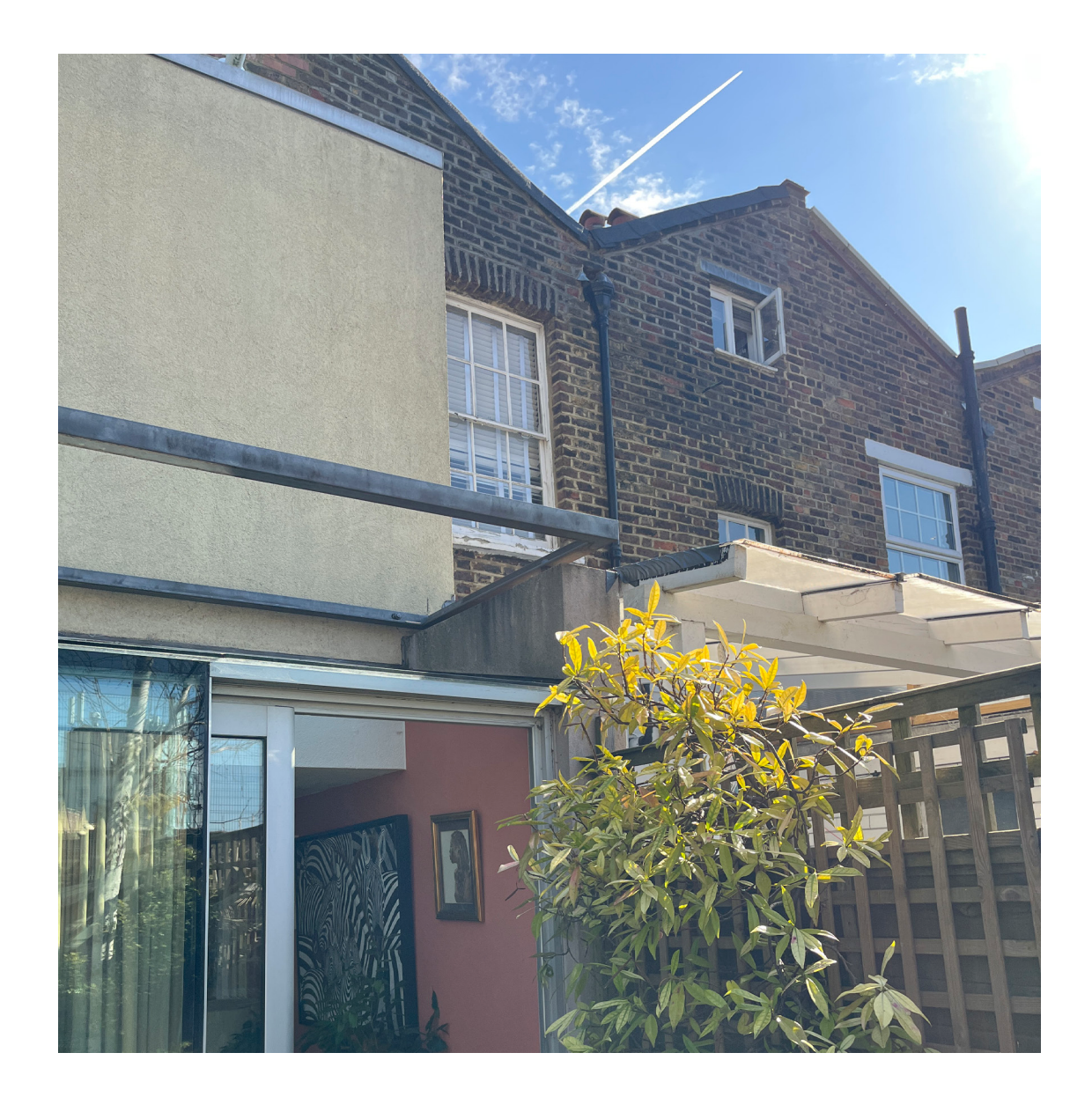
Fig.3: Existing rear extension view. Party wall no.21 Lever-ton street and 23 Leverton street.

Fig.4: Existing rear extension view. Party wall no.21 Leverton street and 19 Leverton street.