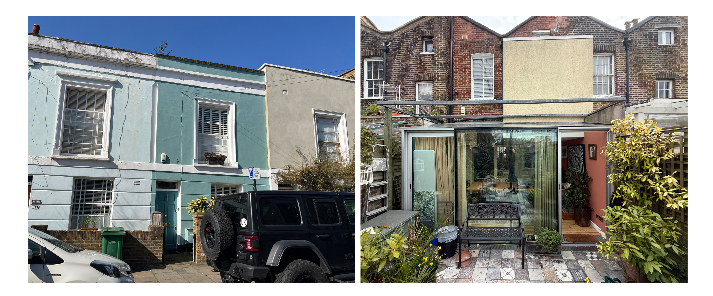
Fig.1: Front elevation view to 21 Leverton street.

Fig.2: Rear elevation view to 21 Leverton street. 23 Leverton street to the left. 19 Leverton street to the right.