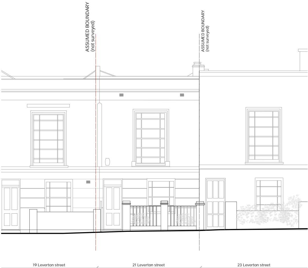
6 proposed front elevation