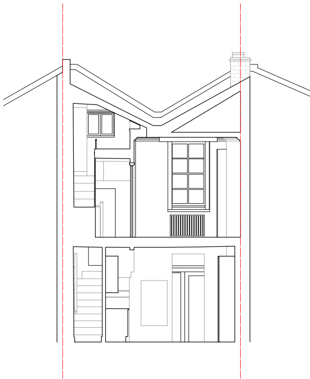
7 existing section B

8-11 St Johns Lane London EC1M 4BF 020 8080 2055