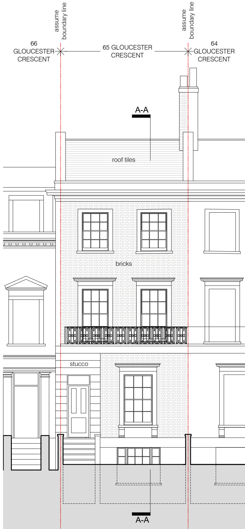
01 PROPOSED FRONT ELEVATION scale 1:100