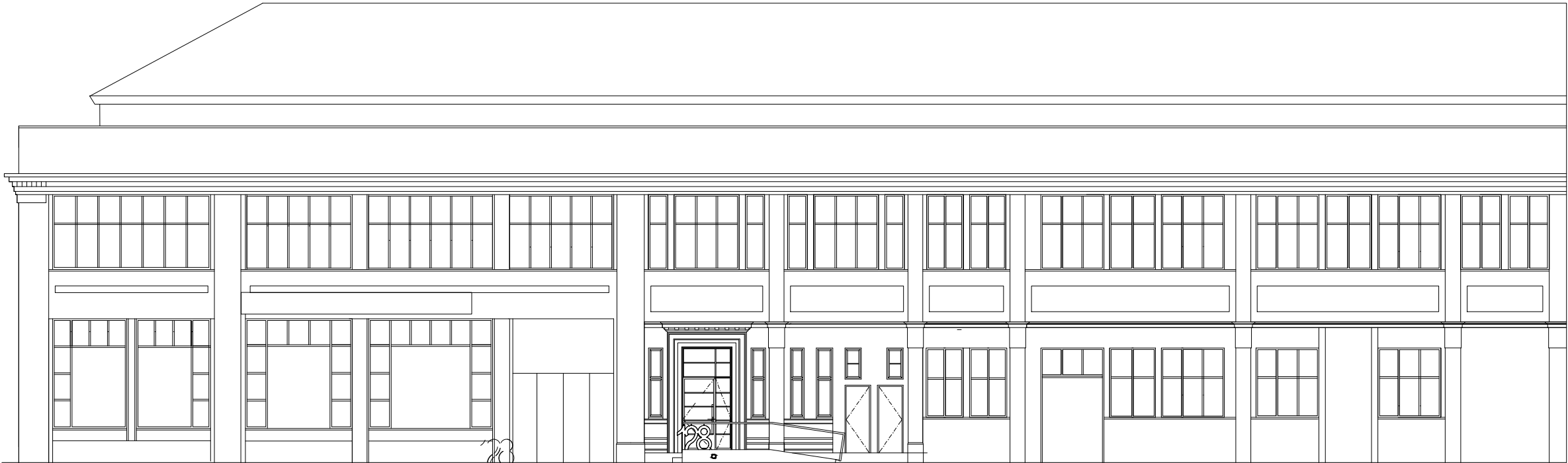
01 EXISTING ELEVATION - ALBERT STREET