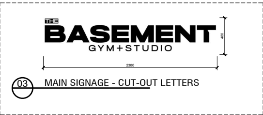
03 MAIN SIGNAGE - CUT-OUT LETTERS

CONCEPT: NON-ILLUMINATED ALUMINIUM 3D BUILT-UP LETTERS POWDER COATED IN BLACK MATT FINISH (RAL: 9005)