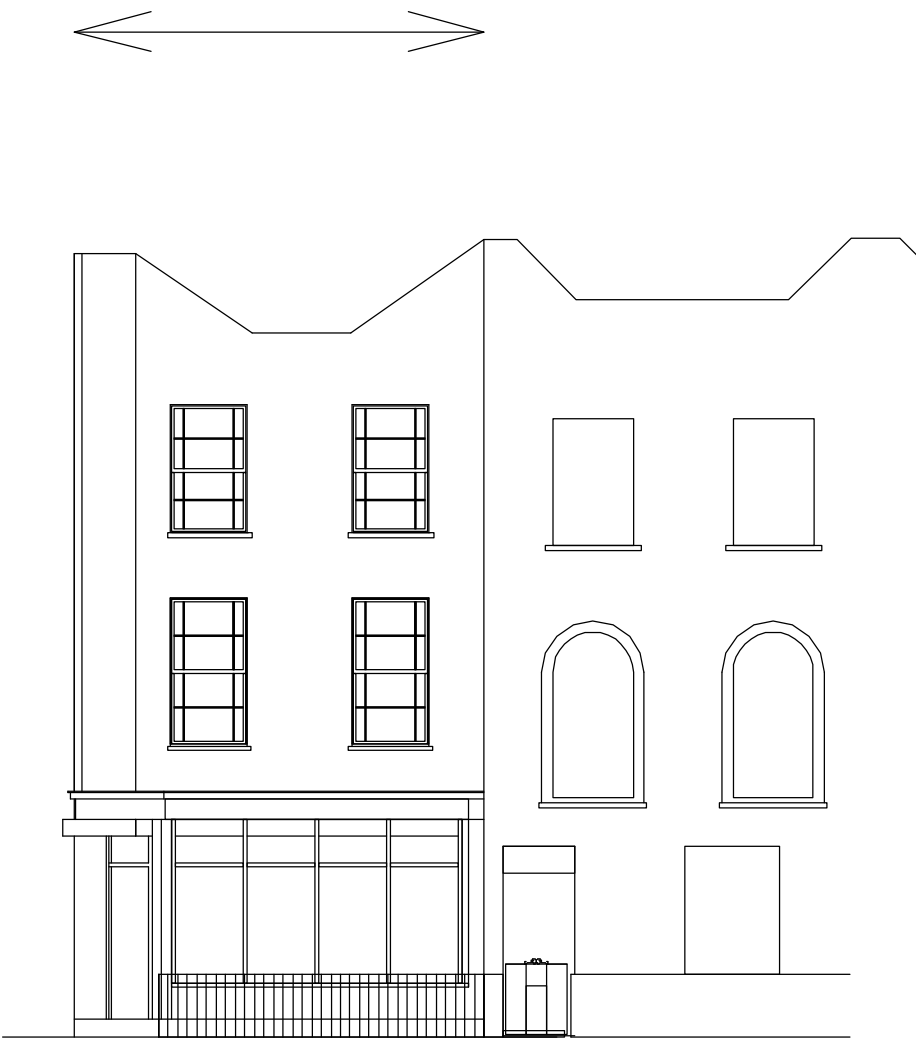
2 Grafton Rd context Scale: 1:100