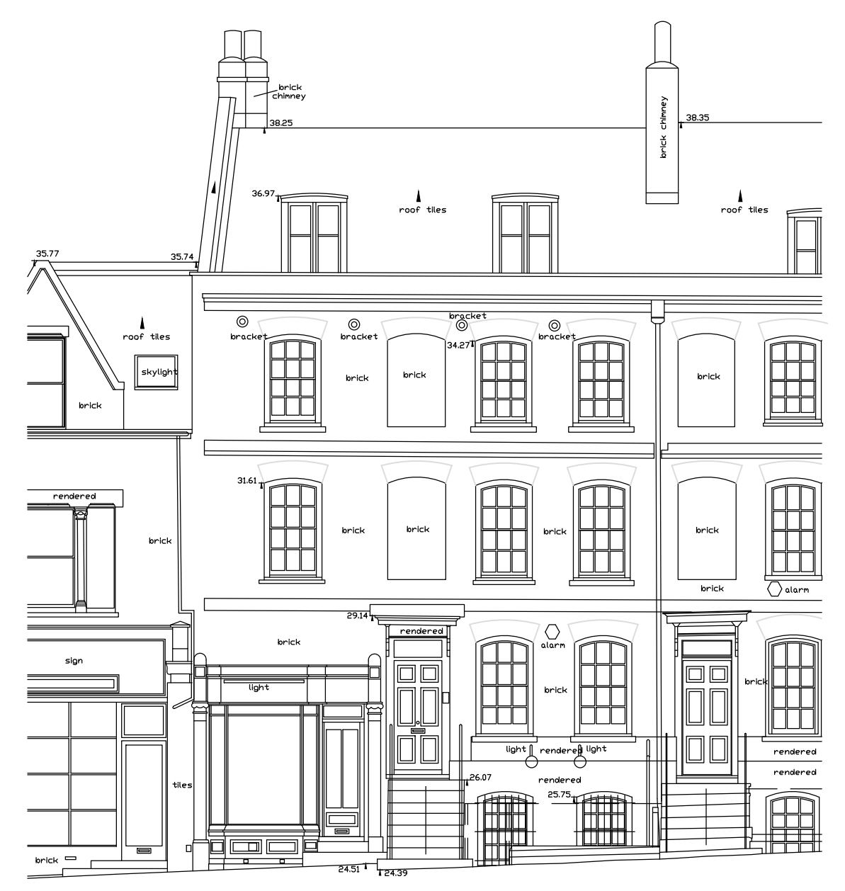
Application site - ground and lower ground floors only.