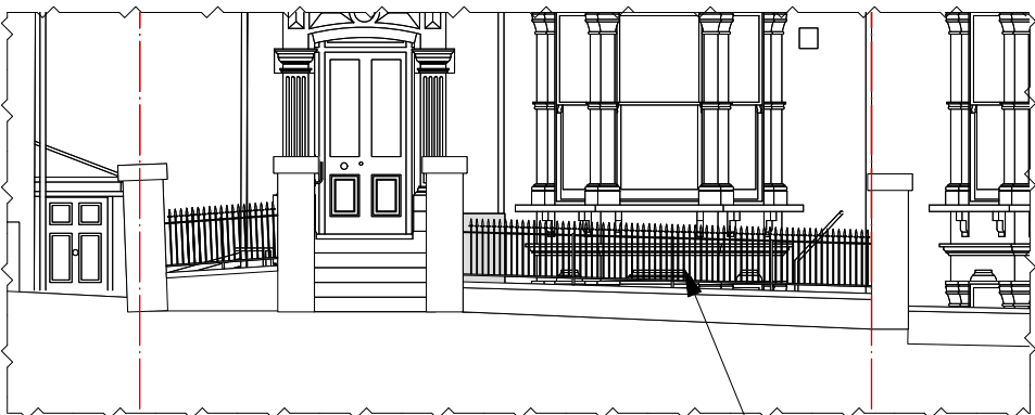
7 Proposed Front Railing, Bin & Bike Store Elevation Scale: 1:100