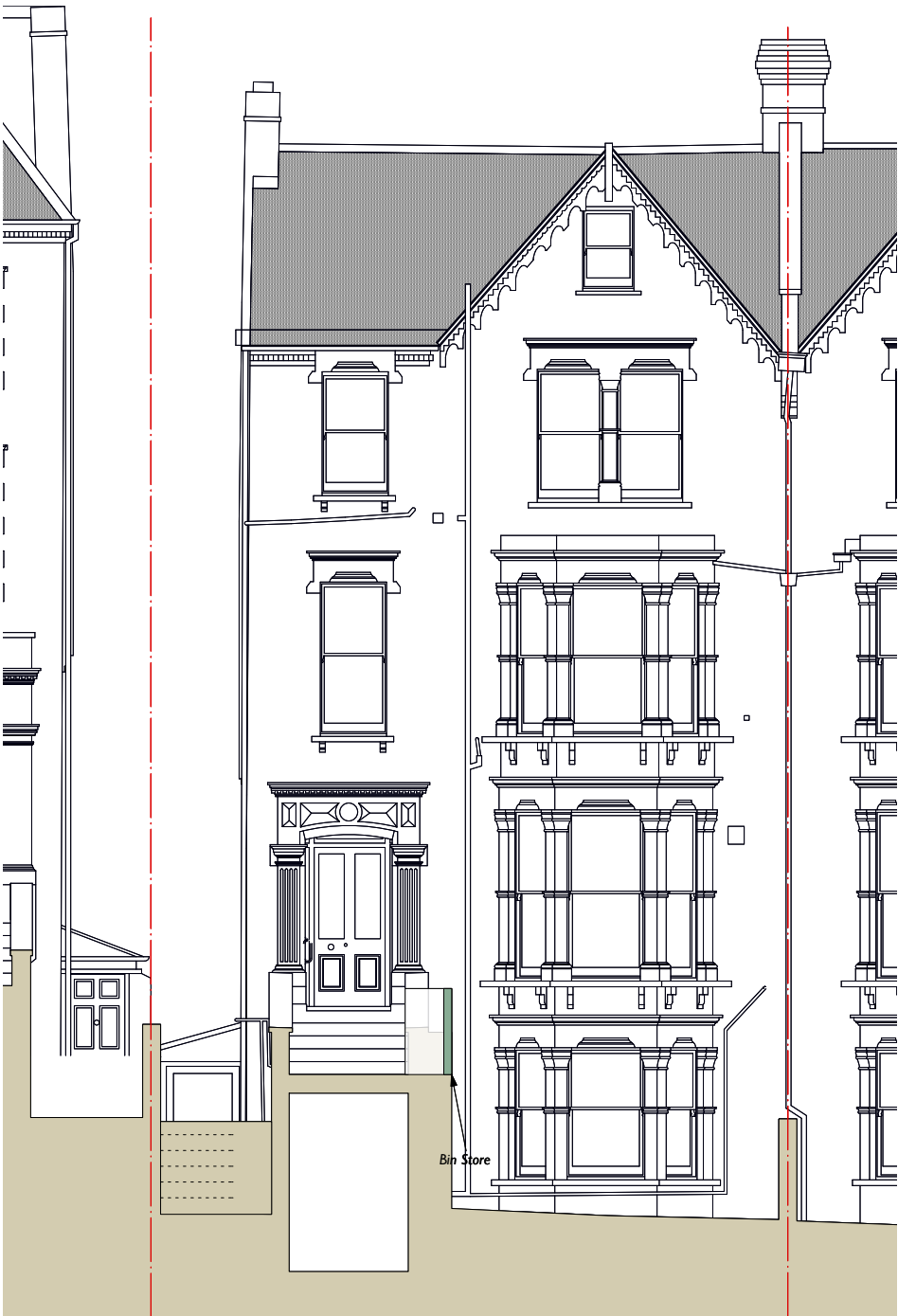
3 Section BB Scale: 1:100