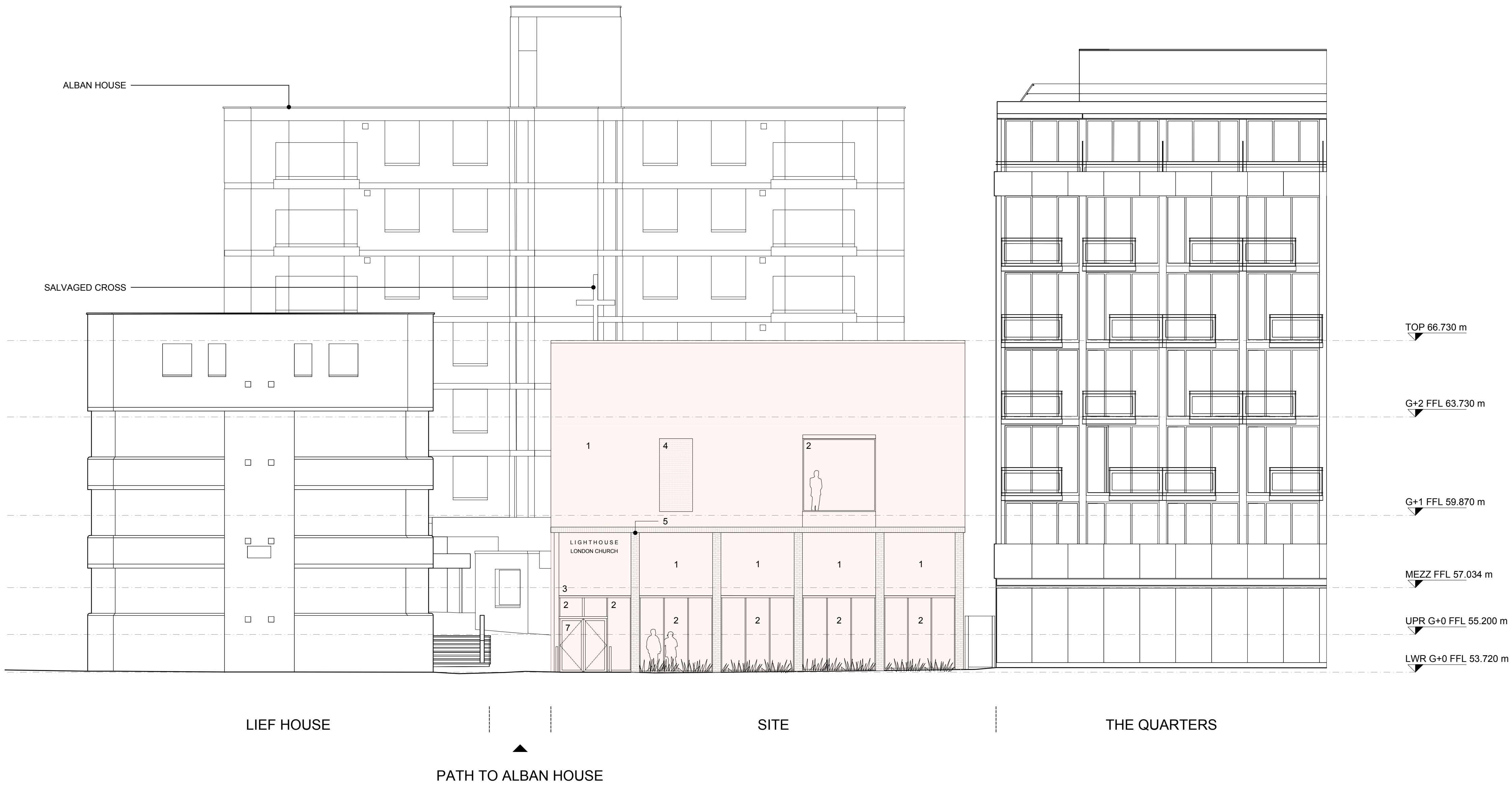
1 WEST ELEVATION

THE CONTRACTOR IS TO CHECK AND VERIFY ALL BUILDING AND SITE DIMENSIONS, LEVELS AND SEWER INVERT LEVELS AT CONNECTION POINTS BEFORE WORK STARTS. THIS DRAWING IS TO BE READ AND CHECKED IN CONJUNCTION WITH ENGINEERS AND OTHER SPECIALIST DRAWINGS. THE DRAWING AND THE WORKS DEPICTED ARE THE COPYRIGHT OF REED WATTS ARCHITECTS AND MAY NOT BE REPRODUCED EXCEPT BY WRITTEN PERMISSION.