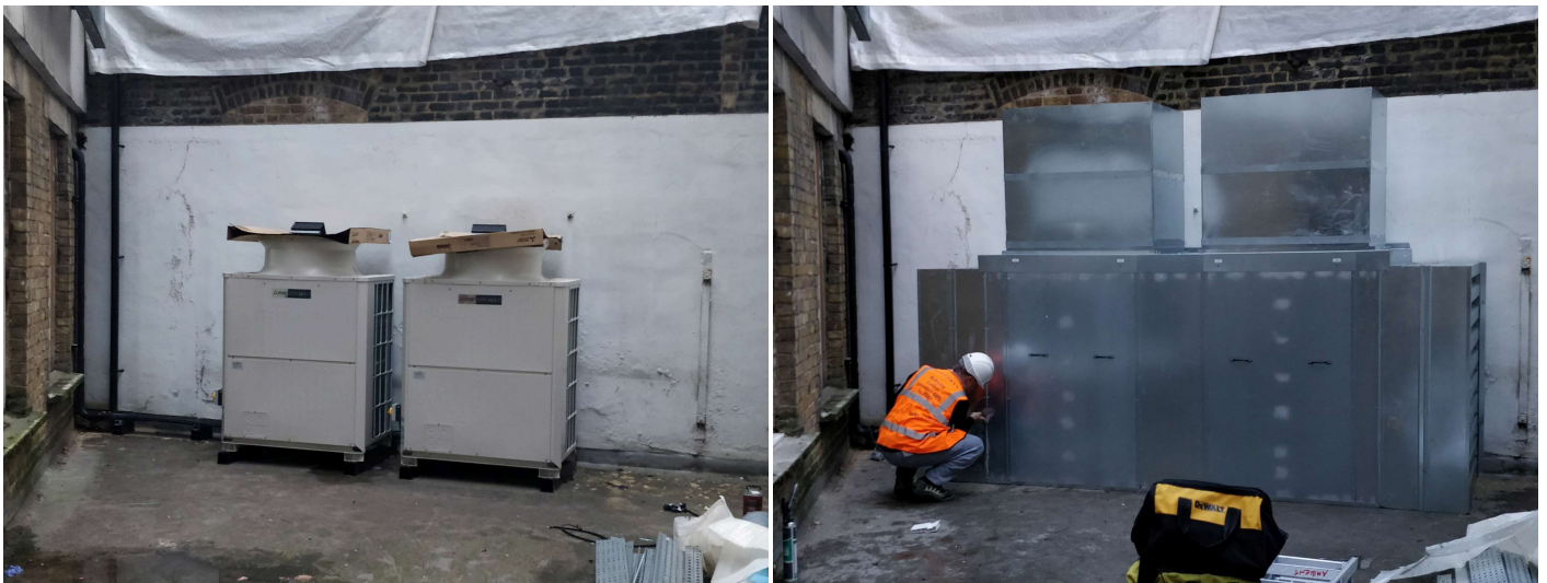
The above pictures show before and after installing a 16dBA reduction wall-attached enclosure around 2 x Mitsubishi L-Module units

The enclosures can be either wall-attached or free-standing depending on the positioning of the units on site; with either a 12dBA or 16dBA level of noise reduction.