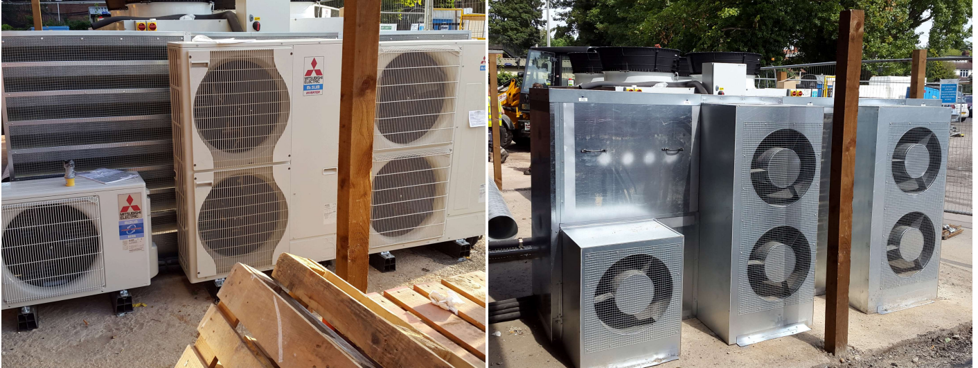
The above pictures show before and after installing a 12dBA reduction free-standing enclosure around 3 x Mitsubishi split type units

Again, these enclosures are either wall-attached or free-standing and come in either 12dBA or 16dBA reduction. They can also house singular or multiple units depending on the site.