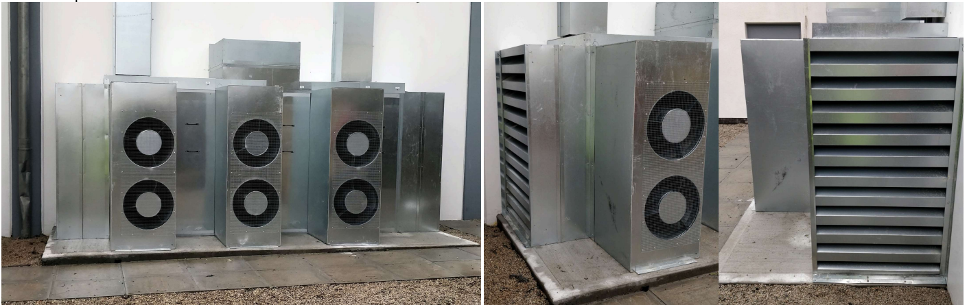
The below pictures show a 16dBA reduction wall-attached enclosure around 3 x Toshiba Twin-Fan units

Please note that even though the above pictures show all of our enclosures in a galvanised finish, we can also offer polyester powder-coated enclosures to any stock RAL colour. Here are some examples: