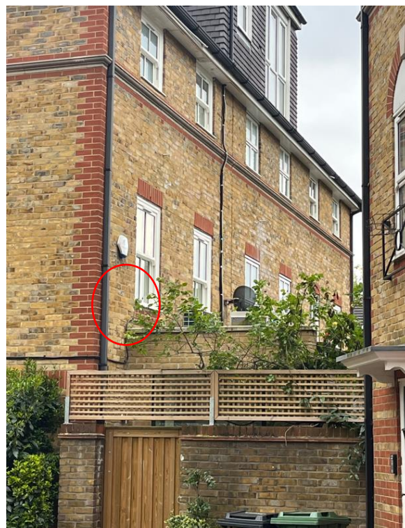
Figure 3: Site photo of the area the relocated unit would be displayed.