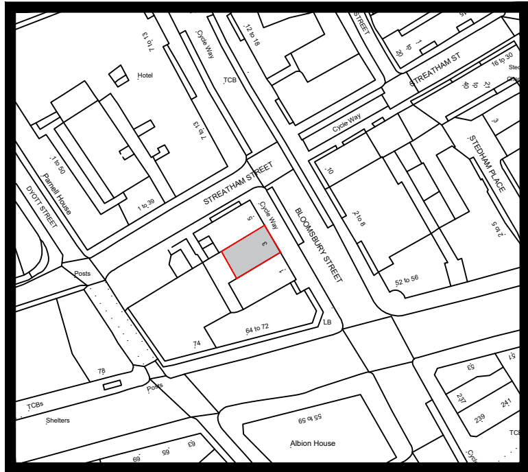
Location Plan Scale: 1/1250