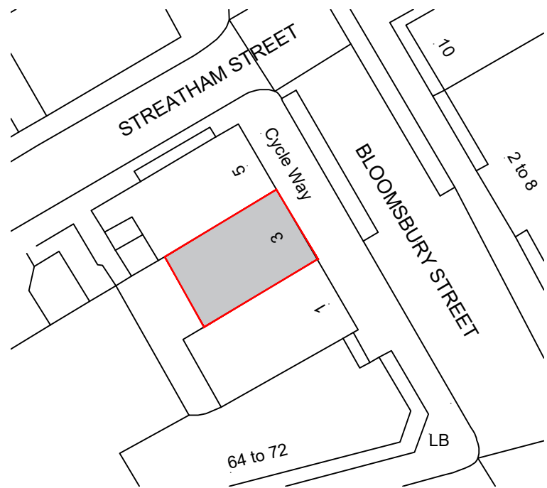
Block Plan Scale: 1/500