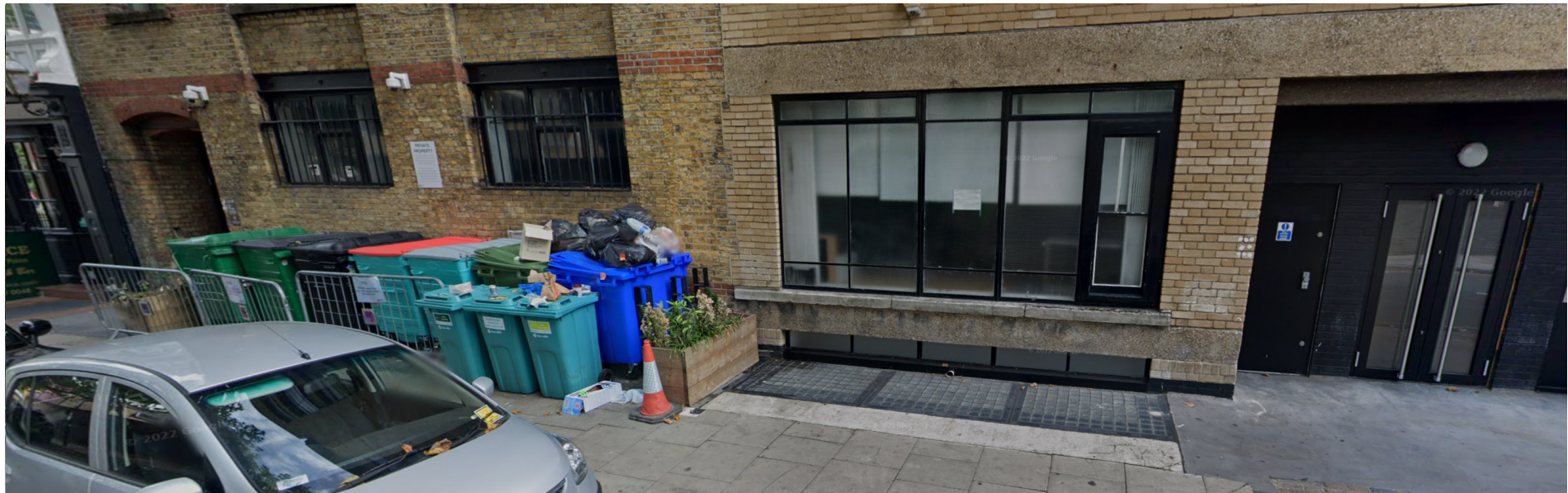
2 Existing West Elevation - Photo

1. This is an existing building and therefore all dimensions are nominal only. Drawings are based on survey drawing from Plowman Craven, as designed drawings and their accuracy cannot be guaranteed.