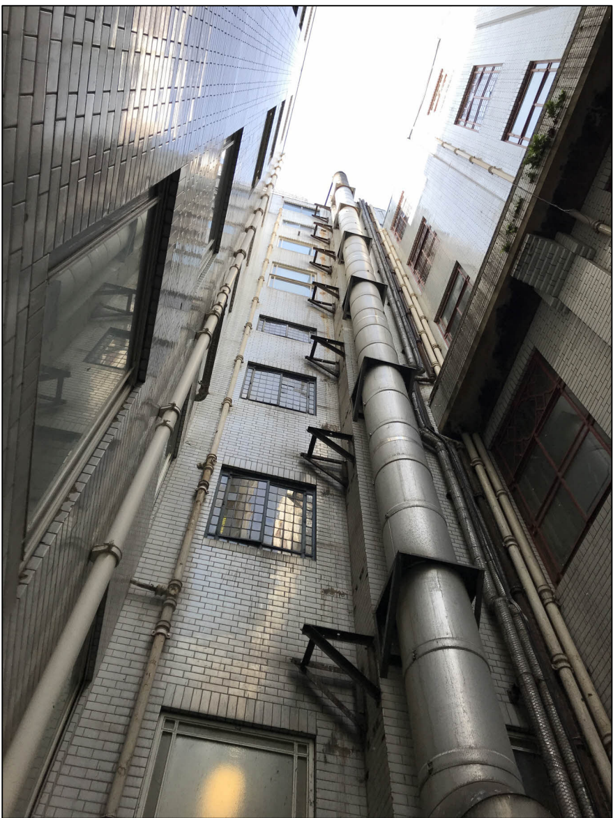
SOUTH EAST FACING ELEVATION