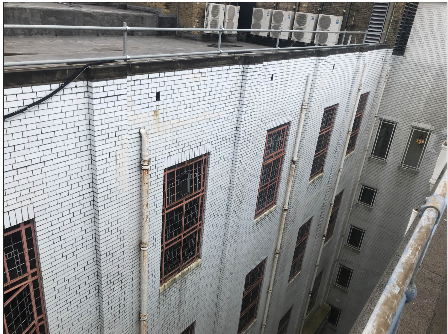
SOUTH WEST FACING & NORTH WEST FACING ELEVATION