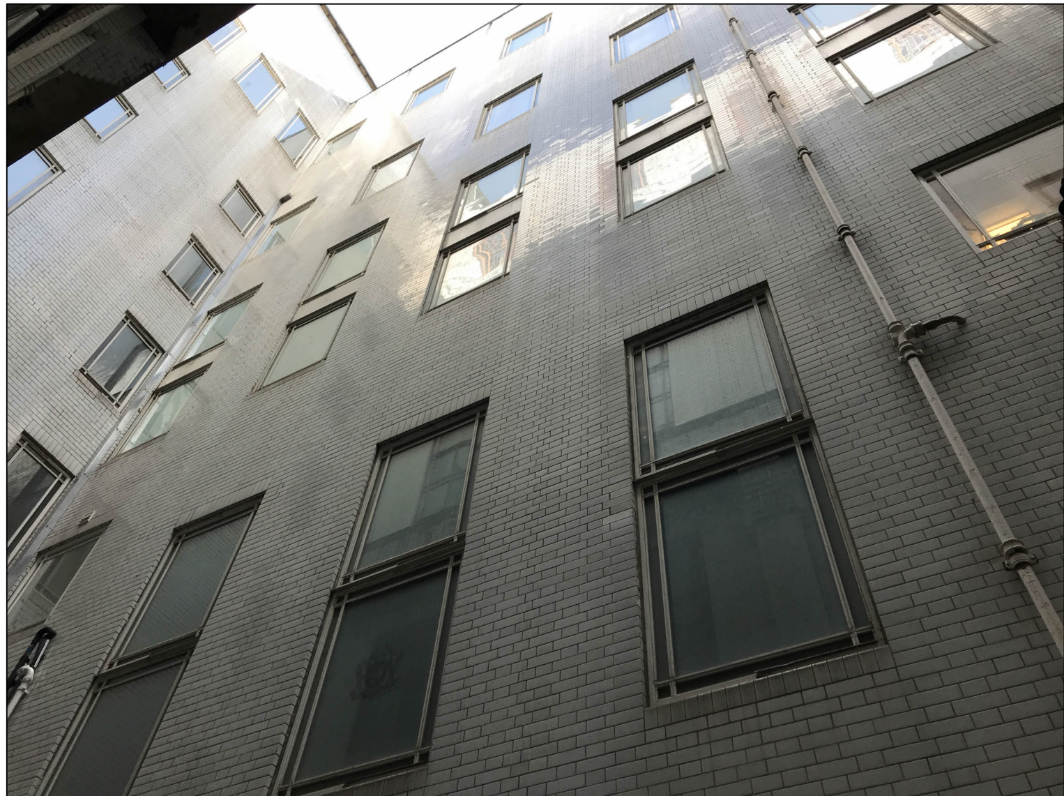
NORTH EAST FACING & NORTH WEST FACING ELEVATIONS