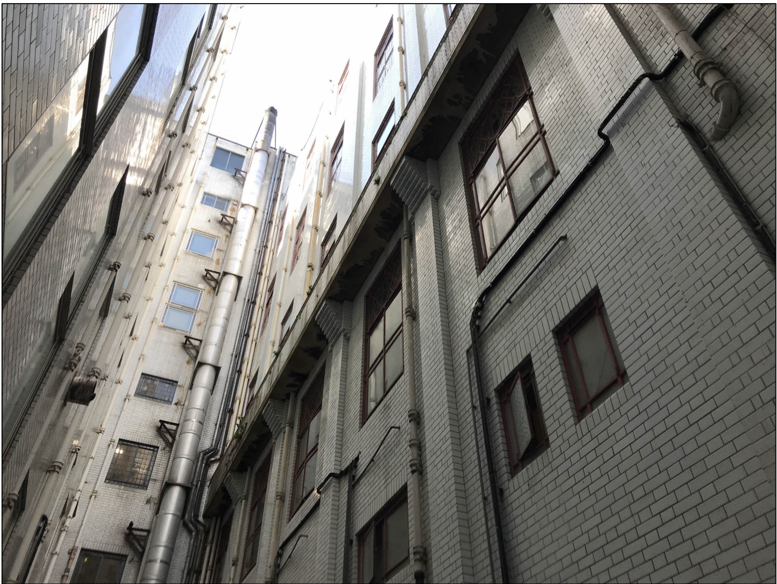
SOUTH WEST FACING & SOUTH EAST FACING ELEVATIONS