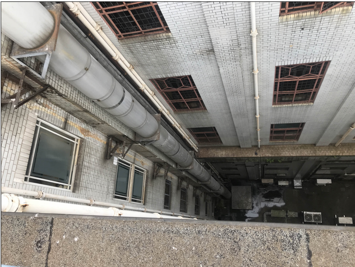
SOUTH WEST FACING & SOUTH EAST FACING ELEVATIONS