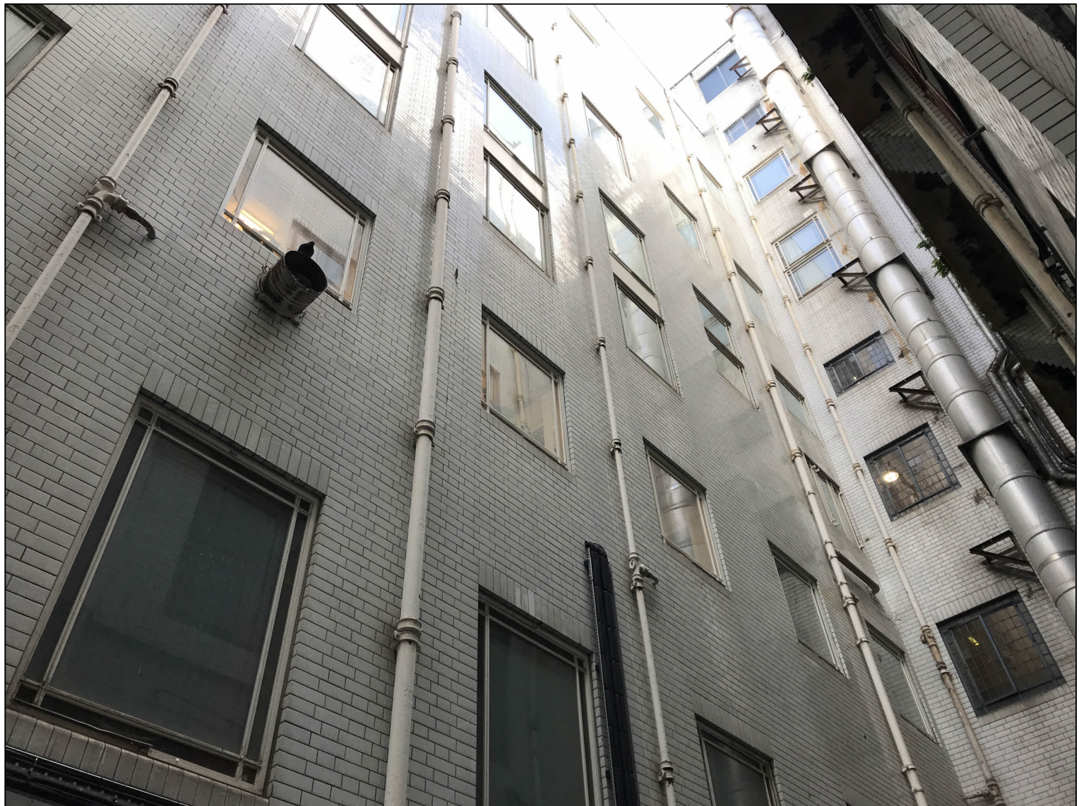
NORTH EAST FACING & SOUTH EAST FACING ELEVATION