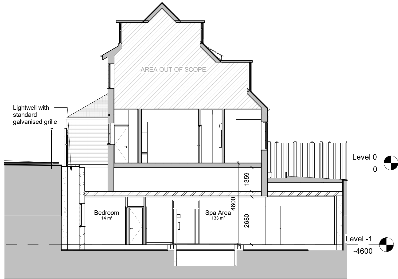
1 Section 1 S501 1 : 100