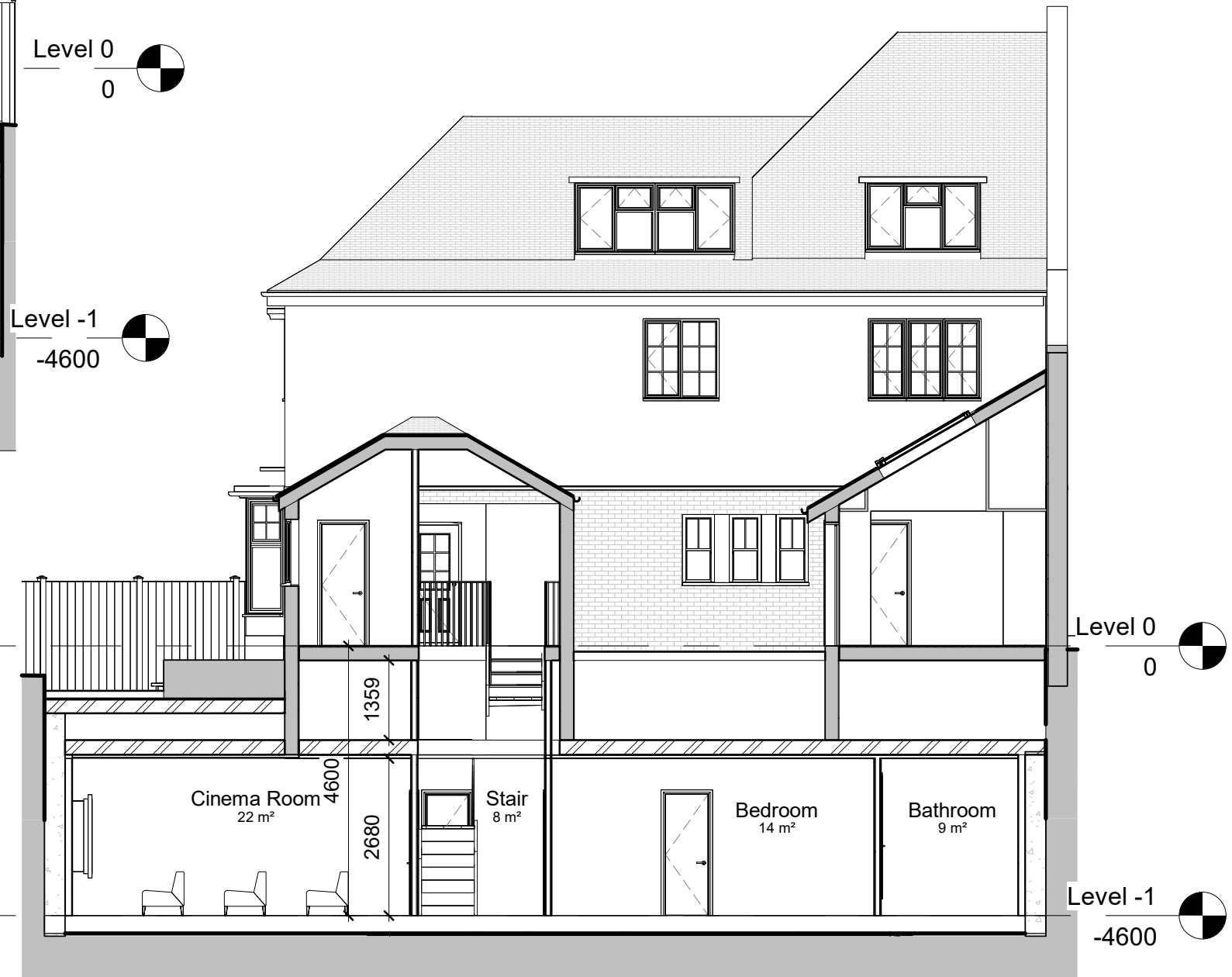
2 Section 2 S501 1 : 100