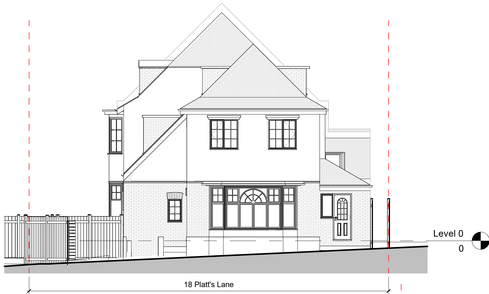
1 E202 SIDE ELEVATION 1 1 : 100