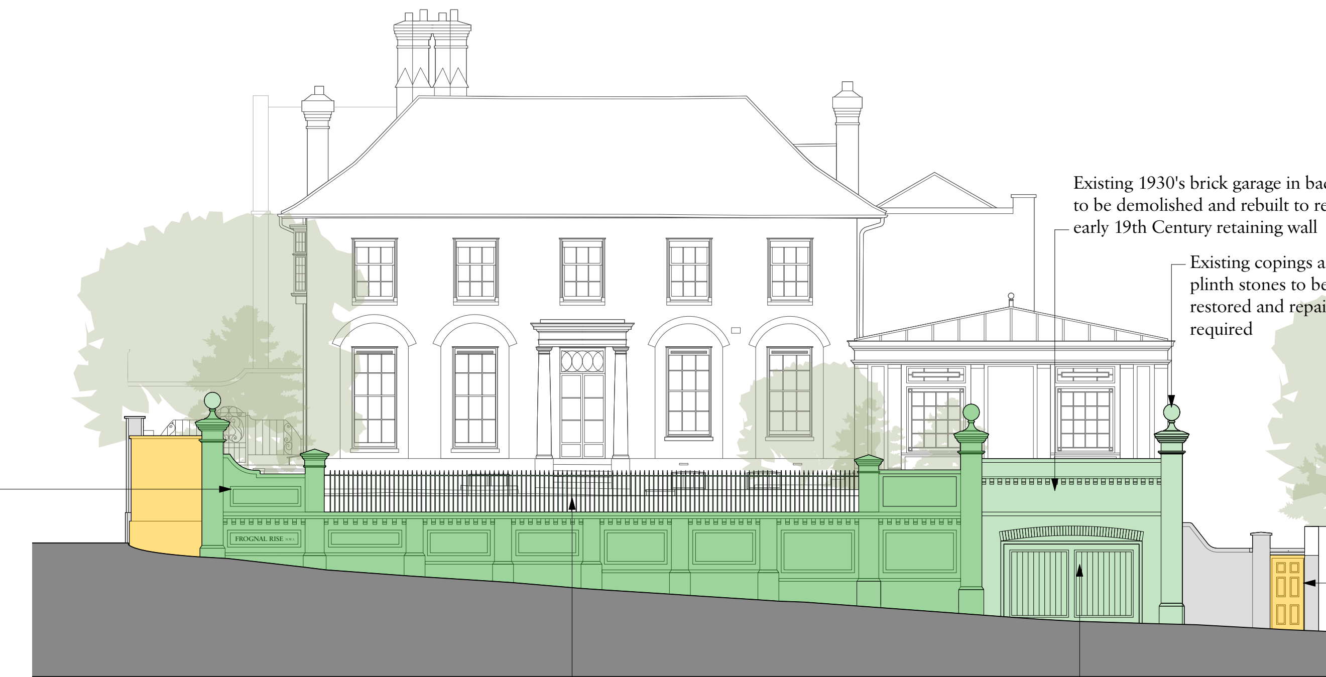
01 South West Elevation Existing & Demolition