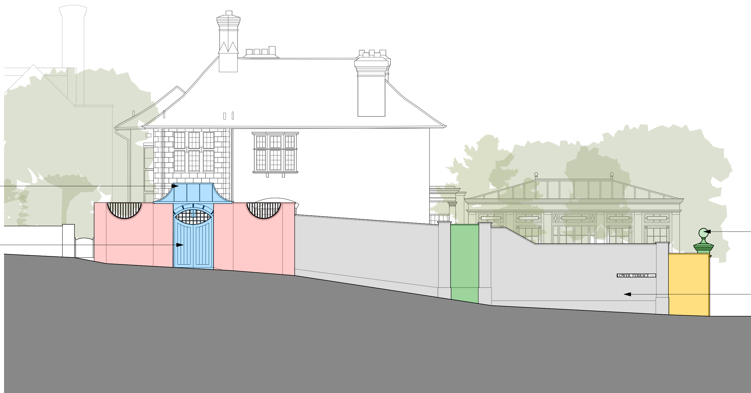
01 North West Elevation Existing & Demolition

14 LOWER TERRACE FROGNAL RISE HOUSE FROGNAL RISE