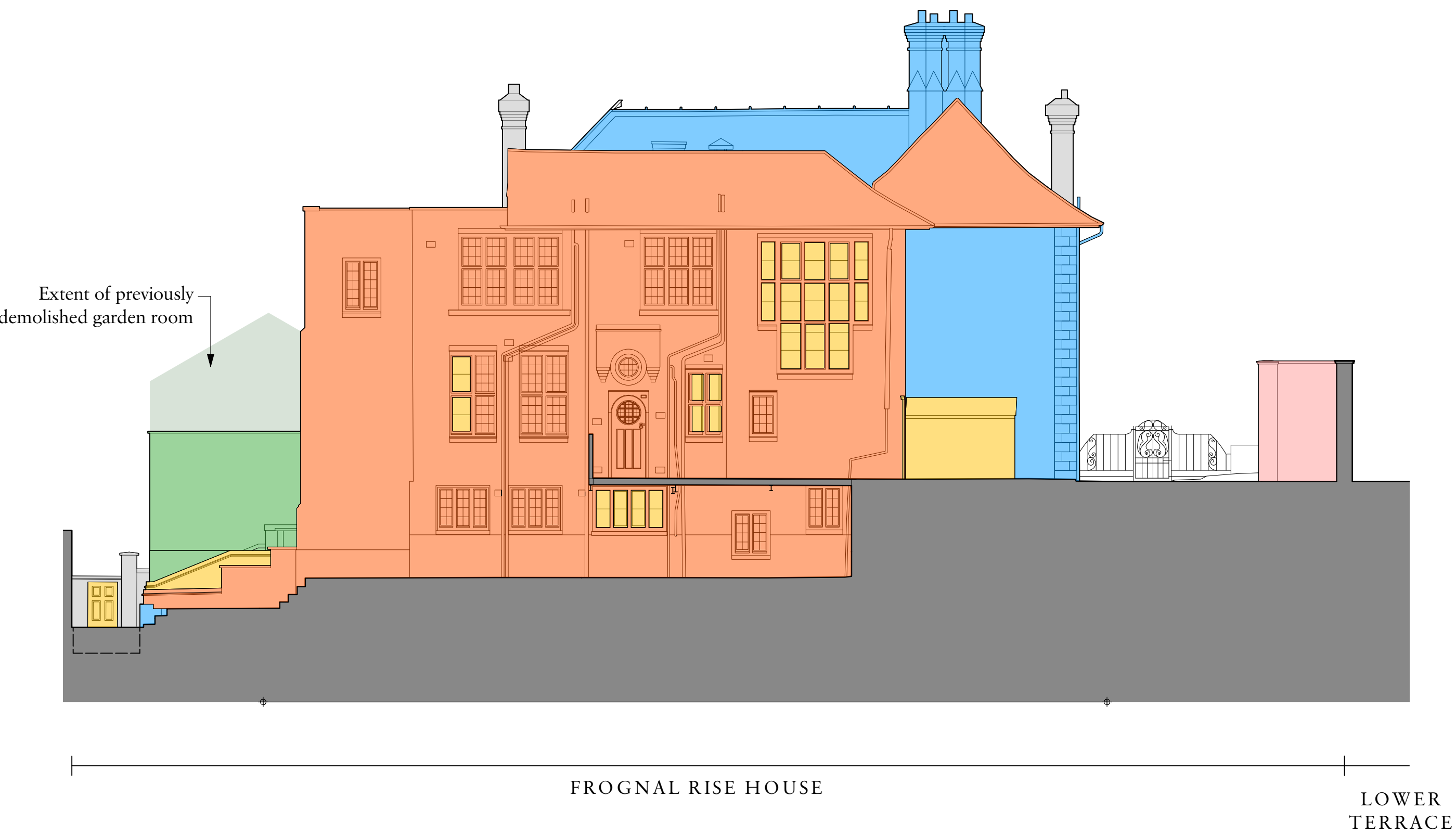
01 North East Elevation Existing & Demolition