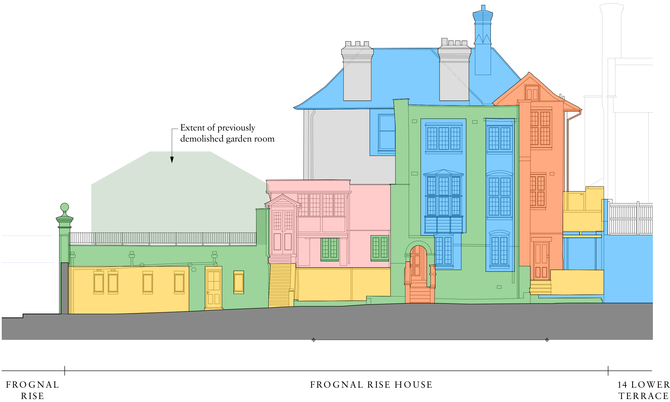
01 South East Elevation Existing & Demolition