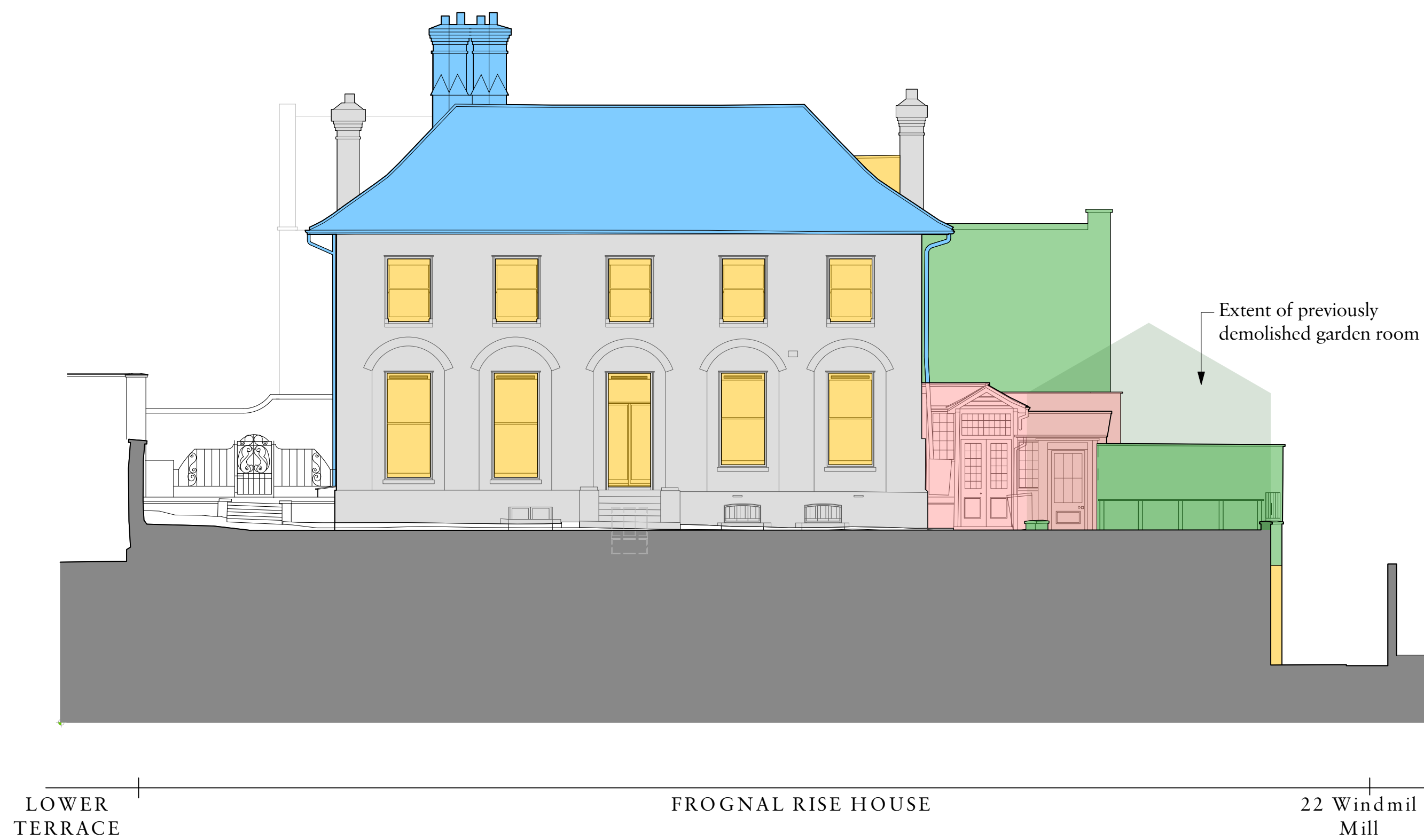
01 South West Elevation Existing & Demolition