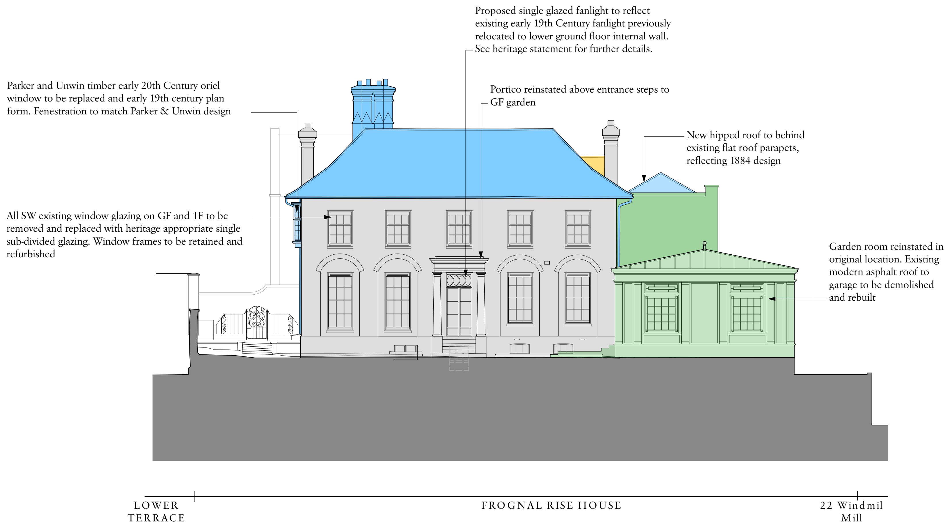
02 South West Elevation Proposed