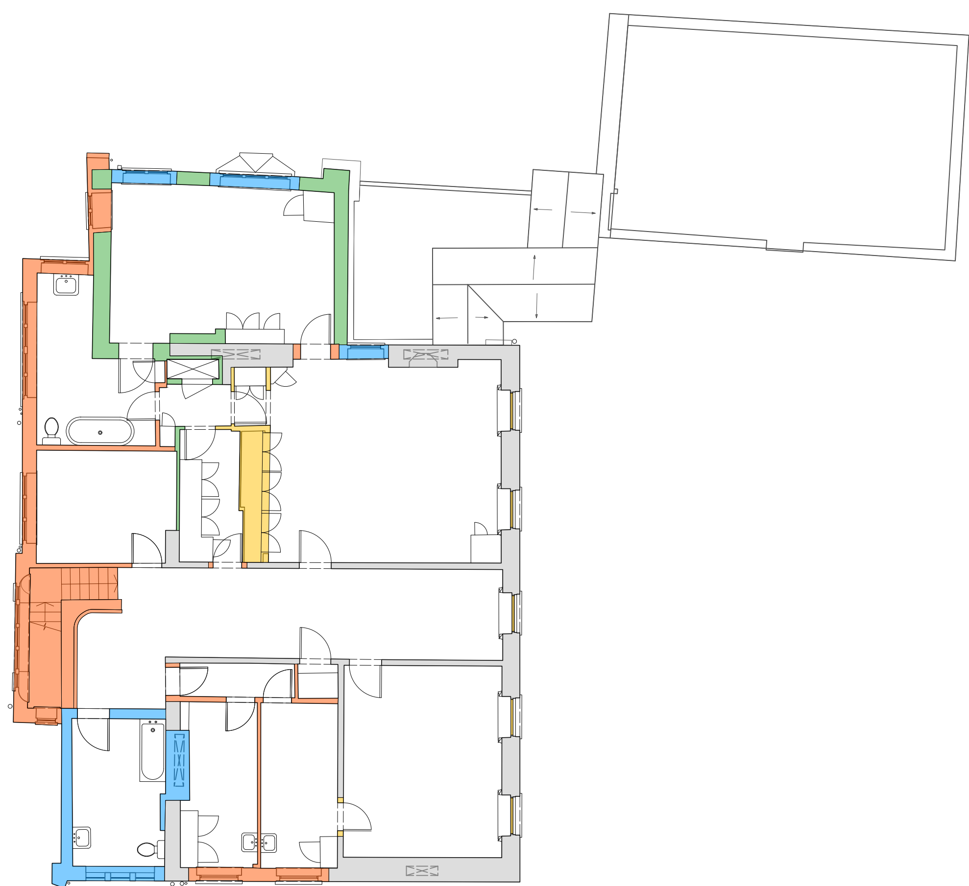
01 First Floor Plan Existing