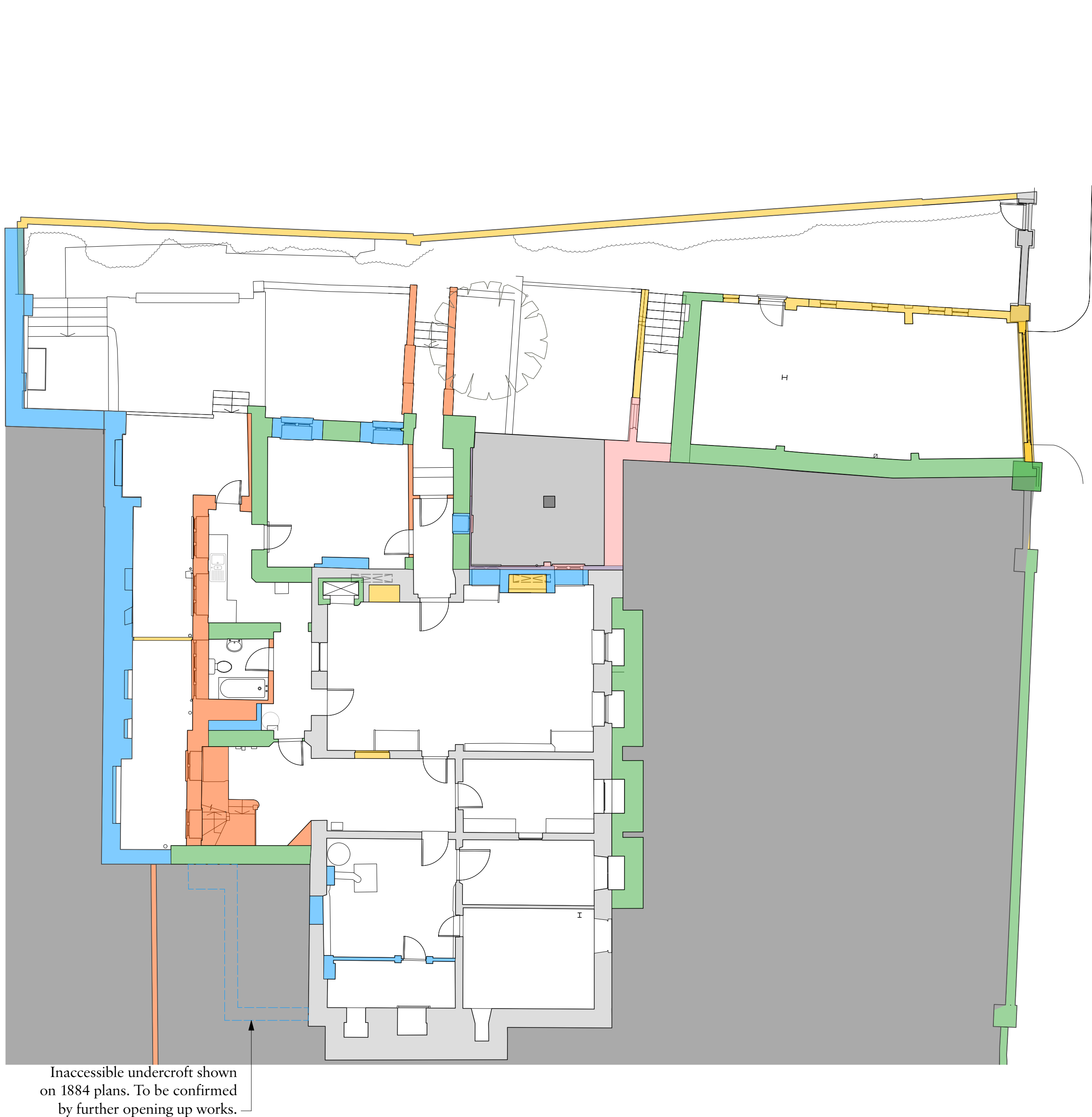
01 Lower Ground Floor Plan Existing